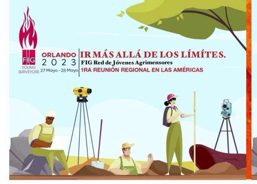
FIG Working Week 2023 – Orlando, Florida, USA