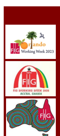
FIG Working Weeks; Pillars & Partners Build on Sustainability