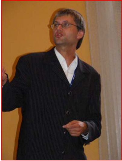
Dr Volker Schwieger

This session gave insights into deformation analysis using strain influence parameters, of alobal ionospheric models on GPS static positioning as well as the evaluation of Quick Bird images in combination with low-cost GPS. The talks were given predominantly young scientists by presenting their first papers at international conferences with encouraging success.