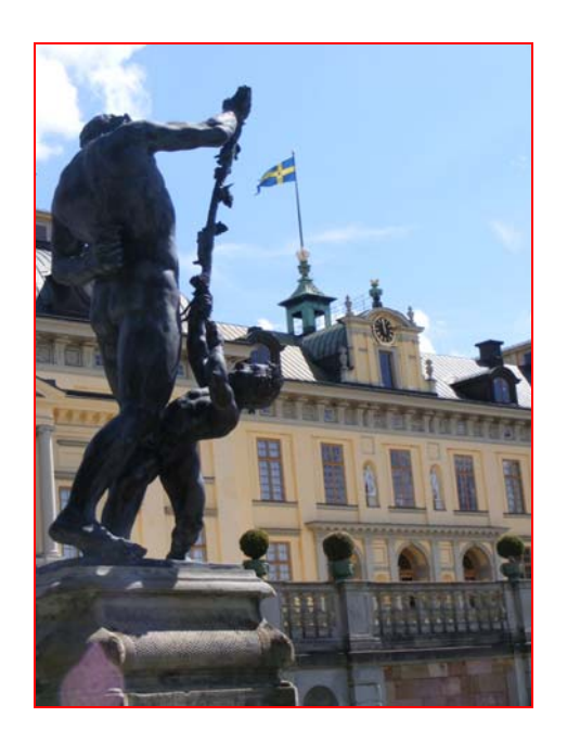
FIG 2008 Working Week Report Stockholm - Sweden

Positioning and Measurement (2007-2010) <u>www.fig.net/figtree/commission5</u>