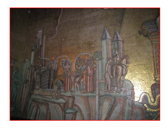
FIG Foundation Dinner at the Vasa