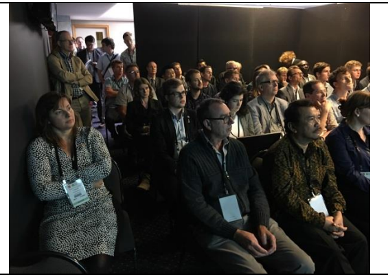
Commision 10 Technical session at 2016 WW in Christchurch (May 2016)