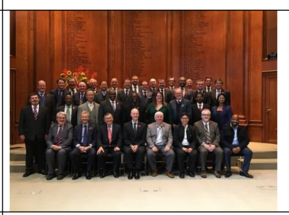
Trustees and SSC members of ICMS Coalition (November 2016)