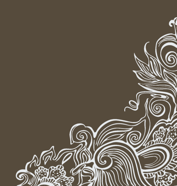
FIG MM 2019 PREPARATION