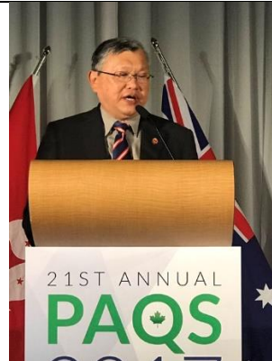
Launch of ICMS in Vancouver (July 2018)