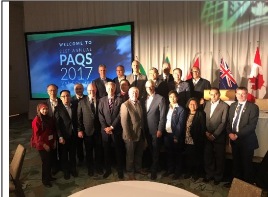
Launch of ICMS in Vancouver (July 2018)