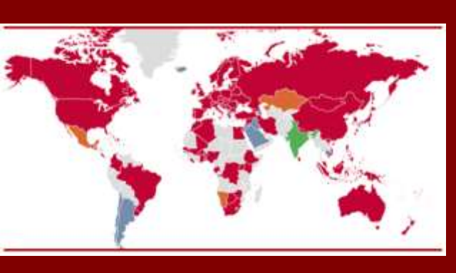
FIG Members Associations Corporates Academics Affiliates Correspondents Honorary Presidents Honorary Members Honorary Ambassadors

Sustainability is about making sure that both internal and external partnerships are working effectively and cultivating stronger engagement