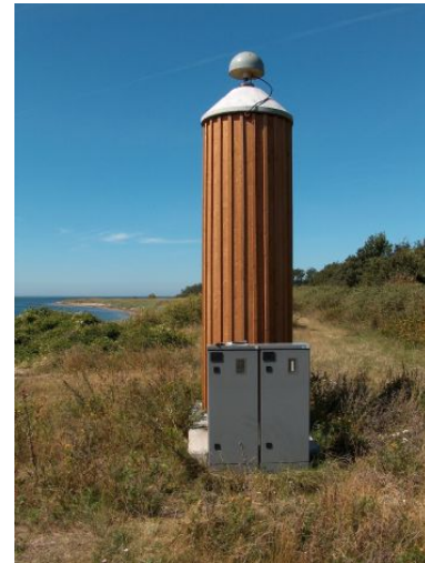
Figure 2.2. Picture of a KMS Reference station (Gedser)

However, the two existing RTK-services in Denmark, GPS-Referencen and GPSnet.dk respectively have previously been cooperating with KMS, as KMS has carried out quality control of the coordinates of the reference stations in the networks. Thereby KMS has good knowledge of the two services and is in principle approving their functioning. For that reason, the Norm for RTK-services is basically designed in such a way that the two existing services should be able to comply with it.