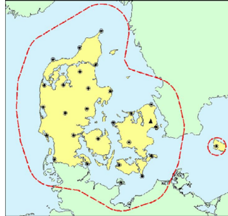
Figure 2.4. Reference stations in GPSnet.dk [6]

An important purpose of the Norm for RTK-services is to monitor the application of new services on the market in mapping and registration tasks, and make sure that the existing services preserve high quality.