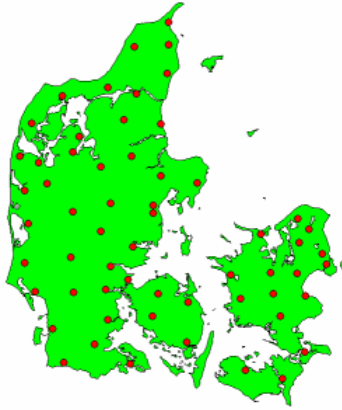
Figure 2.3. Reference stations in GPS-referencen [5]