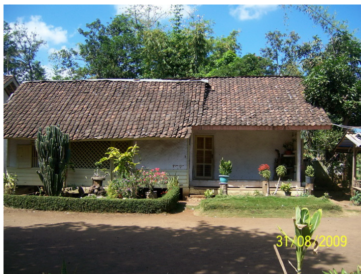
Figure 5 A house in Pulo Quarter

During the reign of Pakuan Kingdom, Cangkuang Temple was built at approximately 8 th century. However, not until the arrival of Mbah Dalem Arif Muhammad the fundamental changes of landscape took place. Mbah Dalem Arif Muhammad built dikes that, in return, lead to the formation of Cangkuang Lake.