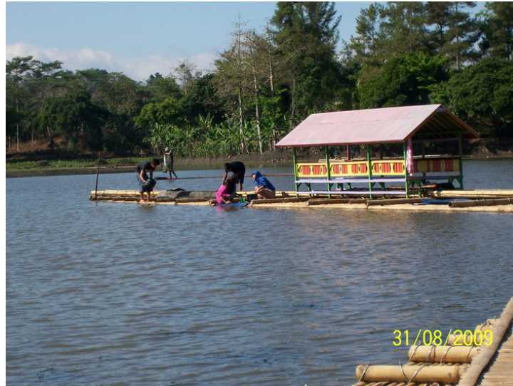
Figure 3 The view of Canguang Lake from Pulo Quarter

traditional shape of the house's roof in West Java and Banten area. Julang Ngapak was designed to avoid the infiltration of rainwater to the ceiling. See Figure 3 for the view of Canguang Lake from Pulo Quarter, as well as Figure 4 and 5 for the mosque and a house in Pulo Quarter. Moreover, due to the restrictions to play gong or to make noises, artistry and sport are least developed.