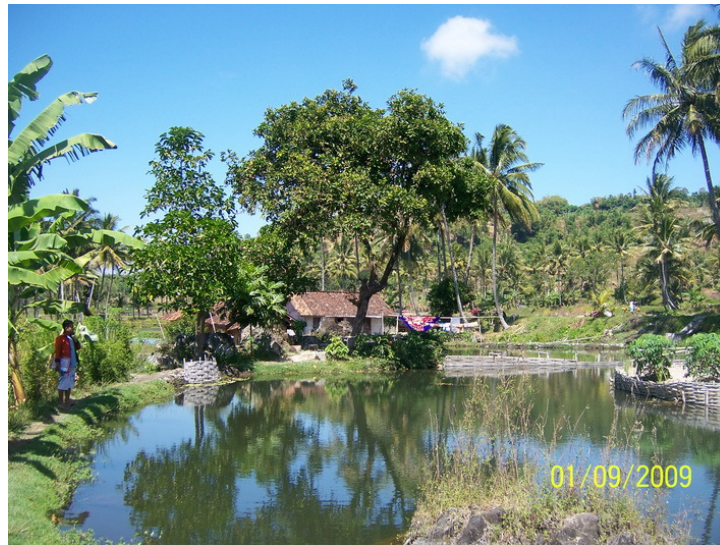
Figure 8 A dike and a house in Situ Quarter

The initial natural landscape of was a quite wide, plain valley surrounded by highly forested area. Cipandak River is passing through this area, which provides the area with enough water supplies. Therefore in the beginning of 20 th century the fish ponds were started to be established. The characteristic of the area that is ideal for supporting fish farming has been contributed to the achievement of the present situation of Situ Quarter.