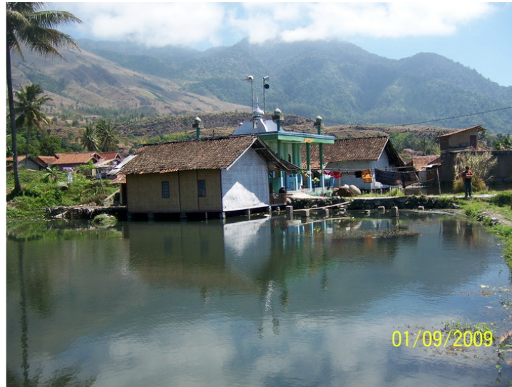
Figure 6 The houses in Situ Quarter

As previously mentioned, all houses in this quarter are facing the dikes that separated one fish pond to another. Therefore the Situ Quarter settlement has a linear pattern. See Figure 6 for houses in Situ Quarter, Figure 7 for the view to one of the fish ponds and Figure 8 for the dikes delimiting a fish pond.