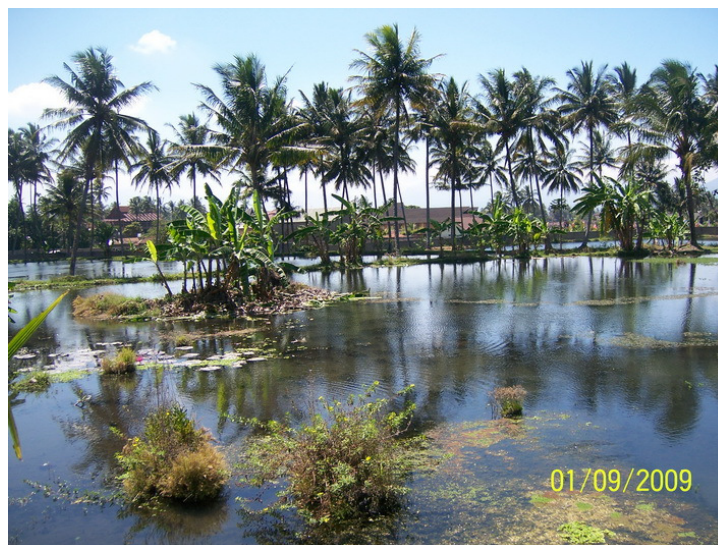
Figure 7 The view of a fish pond from one of the houses in Situ Quarter