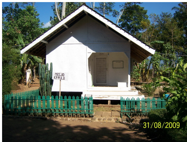
Figure 4 The mosque of Pulo Quarter