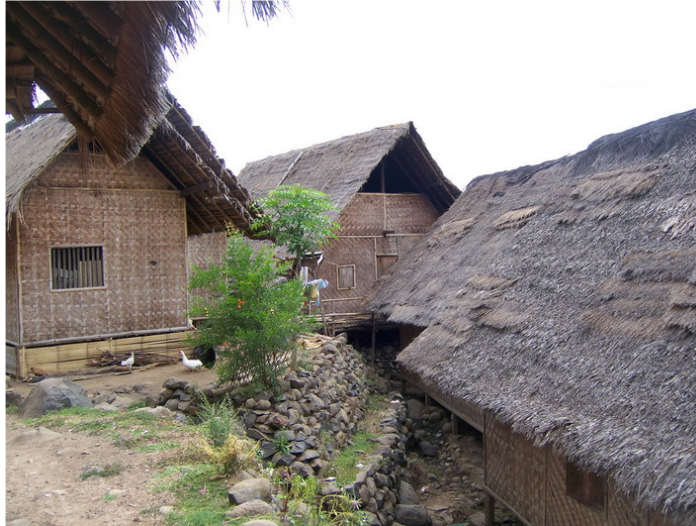
Figure 9 Houses in the terraced Dukuh Quarter