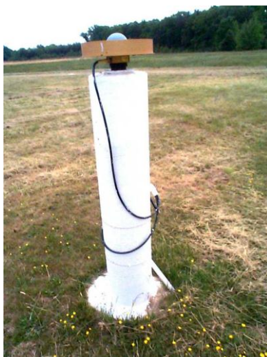
Figure 3. A pillar mount

- a pillar mount is recommended to be 2 to 2.5 m in height and poured to a depth of 4m. Conduits within the concrete pillar may produce cracks in the pillar over time (see Figure 3).