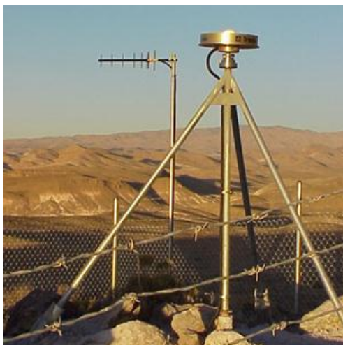
Figure 2. A deep-drilled braced ground mount

- a pillar mount is recommended to be 2 to 2.5 m in height and poured to a depth of 4m. Conduits within the concrete pillar may produce cracks in the pillar over time (see Figure 3).