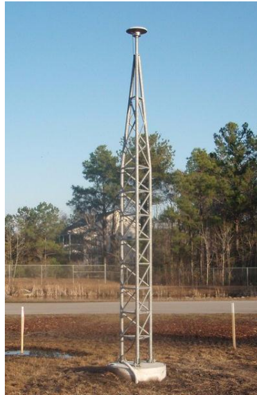
Figure 4. A tower mount

- A tower mount can be used when obstructions or other considerations require elevating the mount beyond the typical pillar construction heights. The foundation is poured to the same depth as pillar mounts. Guy wires may be needed to stabilize the tower (see Figure 4).