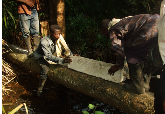
Fig. 4 Precast survey pillars that was planted along the course of the river Banko

The survey pillars (beacons) were of dimensions 22.9cm x 22.9cm x 45.7cm, of which 15.2cm was above the ground. They were used where the boundary had been defined by streams and rivers, (figure 4).