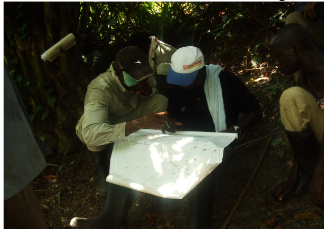
Fig. 2 The survey team studying the topographical map for the area.

Materials such as Site layouts, photomaps and every information that were necessary for the education were obtained from relevant agencies such as the district offices and recognized bodies including the chiefs, elders and caretakers as shown in Figure 2.