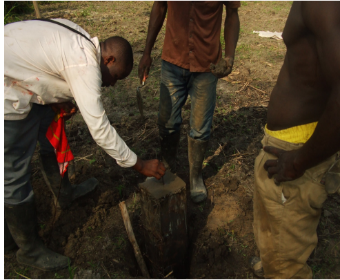
Fig.3 a) Survey Pillar planted insitu.

In the execution of the project, labourers were hired from the adjoining communities as a gesture. This was to give employment to the communities so as to get them to develop interest in the project, and also to make the knowledge of the existence of the boundary pillars known to them, (figure 3).