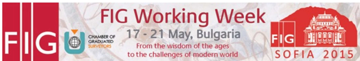
FIG Working Week 2015 – First Call for Papers

http://www.fig.net/pub/monthly_articles/august_2014/strong_pilling.html