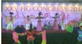
Experiencing the amazing Malaysian Culture

www.fig.net/pub/fig2014/ppt/closing_president_pres.pdf