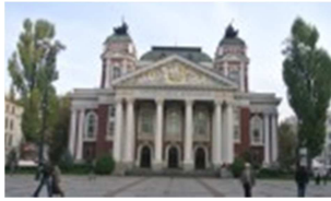
The Theater that is used in the 2015 Working Week logo