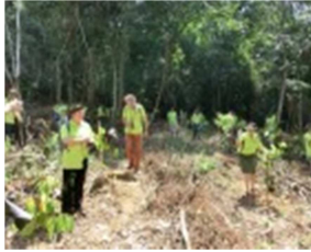
The carbon offset programme