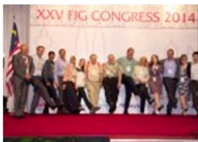
The FIG Congress - where young and experienced surveyors meet