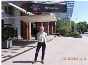
The Conference Centre on a warm June day

with the Finnish landscape paintings dating back to early 1900's. The sun and the forest form a binary one and zero, symbols of digitalisation. This digitalisation is however so advanced that it is no more rectangular and mathematical but describes our analogue world in a way that is more subtle, adaptive, and precise and, thus, offers the people better services.