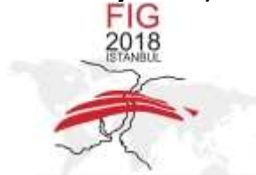
FIG Congress 2018

For additional FIG and FIG Commission events see always up-to-date information at: www.fig.net/events/index.asp