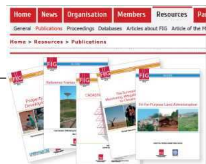
FIG e-Newsletter August 2016