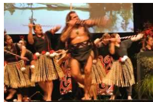
A traditional Maori dance

www.fig.net/news/news_2016/2016_05_ga_report.asp