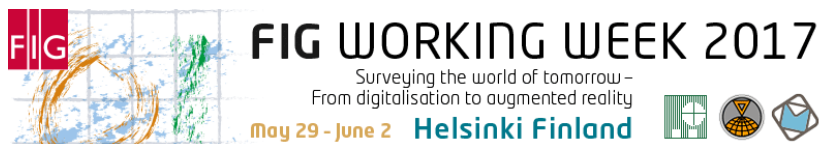
FIG Working Week 2017 – Helsinki, Finland – Invitation and Call for Papers