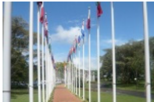
The flag alley entrance to the UN-HABITAT Headquarters at Gigiri, Nairobi.