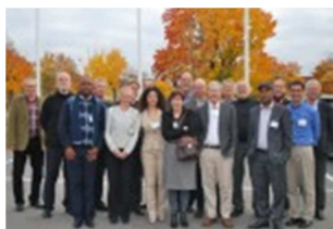
The participants at the 2nd CoFLAS expert meeting

The objective of the CoFLAS project is to develop a useful and practical tool whereby the costing and financing of land administration services in developing countries can be reformed and modernized with a view to enabling the agencies provide cost effective, efficient, sustainable and affordable services. A second Expert Group Meeting (EGM) was hosted by Lantmäteriet at its premises in Gävle, Sweden on 14-15 October 2013 attended by 20 experts. www.fig.net/news/news_2013/GLTN_Gavle_workshop.htm