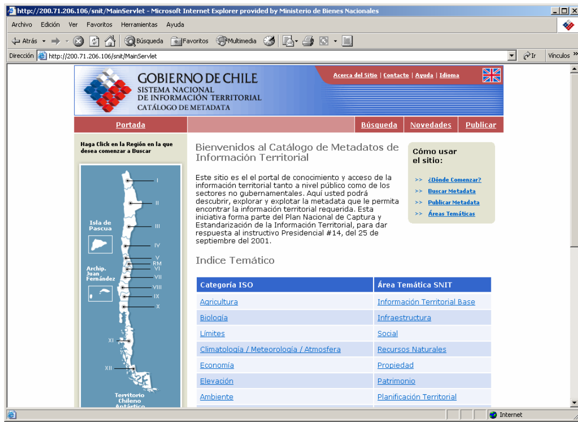
FIG. 3.: MAIN PAGE OF SNIT-CHILE METADATA CATALOGUE

The goal for the year 2005 consists of each organization around the country starting to fill out the forms and thus in the short term make all the information available at national level.