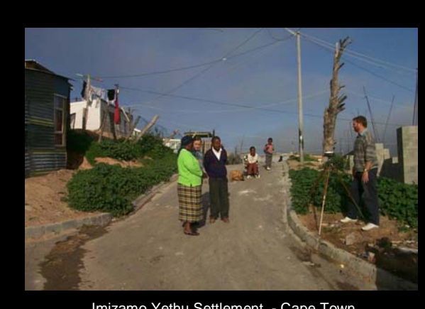
Imizamo Yethu Settlement - Cape Town

Nowadays multi-media records are technically feasible and in some ways inexpensive