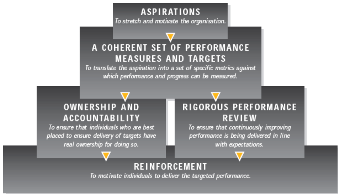
Figure 2: A Performance Management Model (HMT, 2000)

One useful and succinct model for putting in place suitable measures to enable and underpin organisational success is that developed by the UK Public Services Productivity Panel (HMT, 2000). This recognises five key elements which need to be in place: