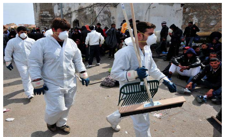
(Photo 1. Immigrants from Tunisia and Libya have arrived on the island Lampedusa, March, 2011)

** - Among countries which "were founded" by emigrants like Australia, Canada, USA only Canada was able to create a multicultural society by integrating people of different origins, which, however, preserve their cultural heritage. While the U.S. has already built up a huge wall at the border with Mexico in order to stop millions of illegal immigrants. Some of the countries from EU try to do the same as long as EU became very attractive for Africans and majority of Asians even though for some of those who have reached the EU and haven't been losted on his way the life in Europe often became a nightmare.