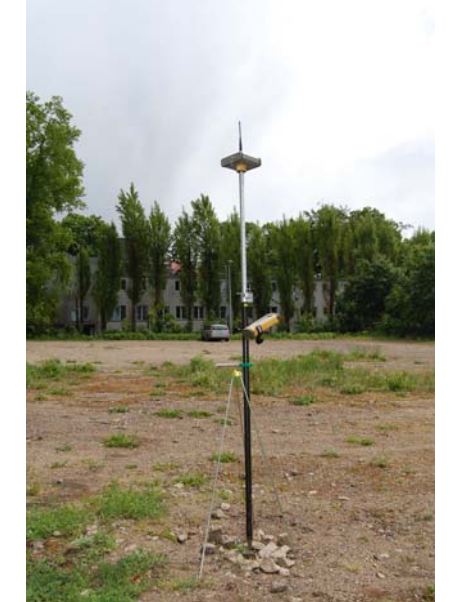
Figure 1. RTK Topcon HyperPro receiver over one of the test marks

The GNSS equipment used for all experiments consisted of two dual-frequency GPS/GLONASS TOPCON HyperPro receivers and Topcon FC-200 compact field controller.