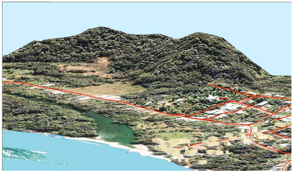
Figure 3.2: MSL at Grande Riviere Beach (3D)

At a simulated 0.4m sea level rise above MSL (Figures 3.3 and 3.4), approximately 2060 m^2 of the beach may be lost, either to inundation or beach retreat. This represents approximately 44% loss of turtle nesting habitat. Private property boundaries also are impacted.