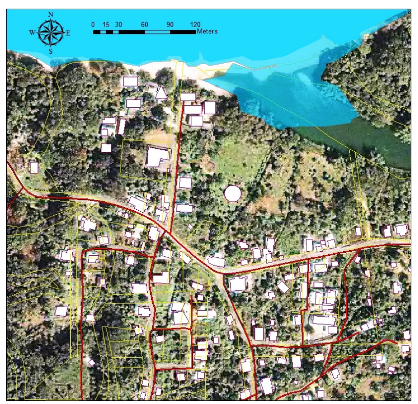
Figure 3.5: Simulated 0.6m above MSL at Grande Riviere Beach

Figures 3.5 and 3.6 show simulated 0.6m sea level rise above MSL. At this level, approximately 2900 m<sup>2</sup> (or approximately 60%) of turtle nesting habitat may be lost to inundation or beach retreat. Private property boundaries continue to be impacted.