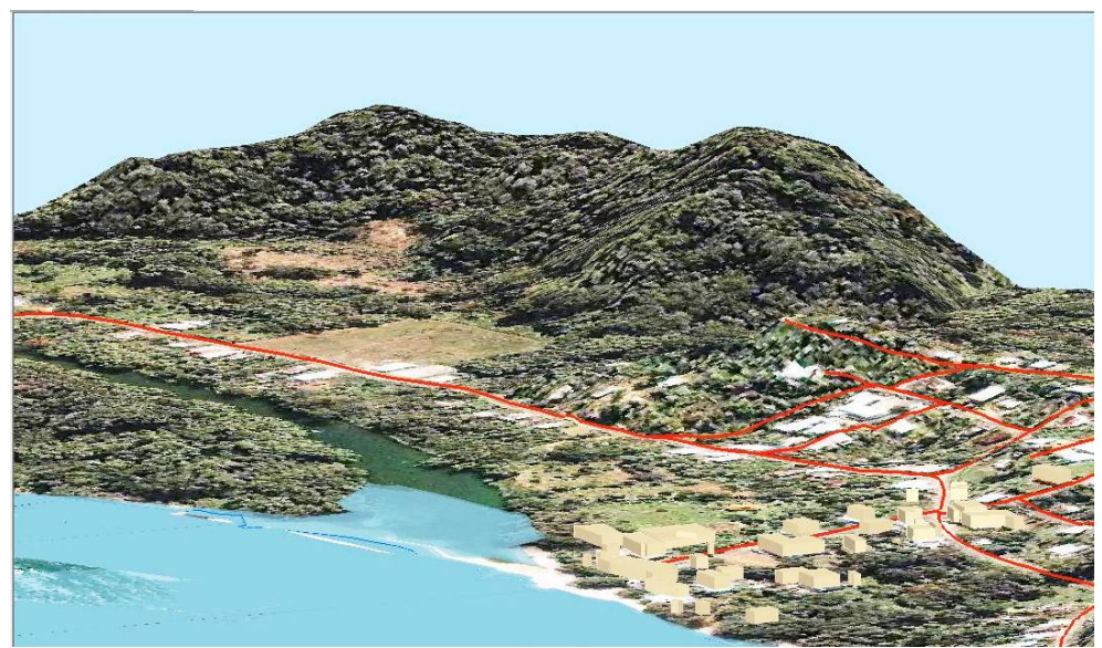
Figure 3.6: Simulated 0.6m above MSL at Grande Riviere Beach (3D)

Figures 3.7 and 3.8 show simulated 0.8m sea level rise above MSL. At this level, approximately 3200m<sup>2</sup> (or approximately 68%) of turtle nesting habitat may be lost to inundation or beach retreat. Private property boundaries continue to be impacted. Additionally, physical infrastructure in the form of a beachfront hotel building begins to be physically impacted.