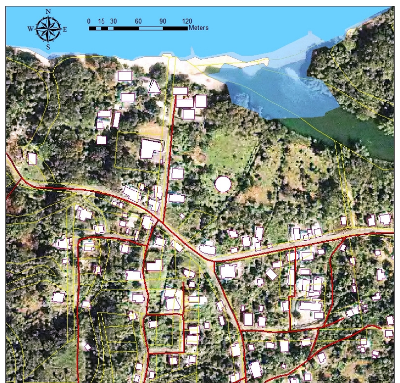
Figure 3.3: Simulated 0.4m above MSL at Grande Riviere Beach

At a simulated 0.4m sea level rise above MSL (Figures 3.3 and 3.4), approximately 2060 m^2 of the beach may be lost, either to inundation or beach retreat. This represents approximately 44% loss of turtle nesting habitat. Private property boundaries also are impacted.