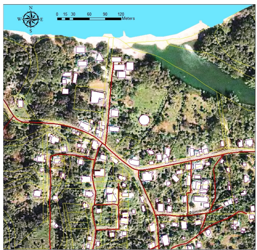
Figure 3.1: MSL at Grande Riviere Beach

Some of the sea level rise impact visualizations resulting from applying the foregoing methodology are illustrated in Figures 3.1 to 3.8 below. Figures 3.1 and 3.2 show 2D and 3D views, respectively, of MSL at Grande Riviere beach. Crudely measured, using the area measuring tool in ArcMap, the beach area where the leatherback turtles nest is approximately 4700 \text{ m}^2 .