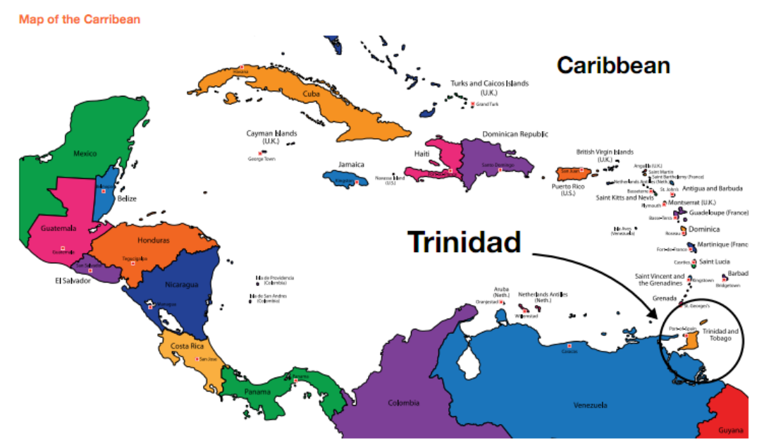
Figure 2 Map of the Caribbean region

"Coasts are the foundation for the well being and economic viability of present and future generations... There is increased pressure on coastal environments with the significant coastal population increase as well as rapid changes in the global climate. The fragility of eco systems existing in the coastal zones is now more than ever, evident and so is the need to manage marine spaces in a more structured and sustainable manner... Recent natural disasters have demonstrated an urgent need to increase our understanding of the natural processes that threaten our coastal communities." (Reeve, Chadwick and Flemming, 2004).