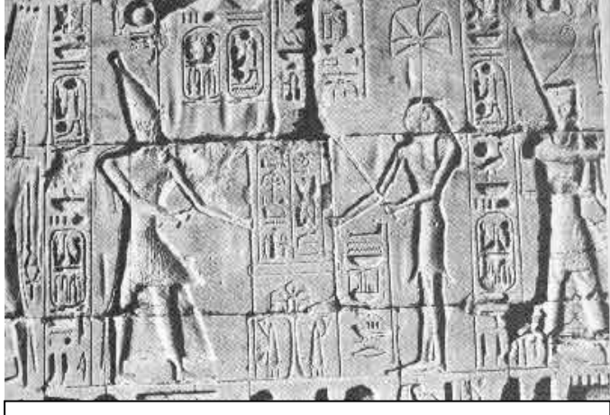
Figure Three. Pharaoh faces the Goddess Seshat in this relief carving on the wall of the Temple at Edfu

of the House (called) Hor-Ren, and the 4th year building ceremony (for) the House (called) "Shelter-of-the Gods" during the period of the last King of the Second Dynasty, known as King X (known to be Khasekhemwy) because his name was also missing (c.2687 B.C.). Upon the various images found in varying places from different eras the king is shown with the goddess Seshat, often referred to as the goddess of the Scribes of the Fields and wife of the ibis headed god Thoth,