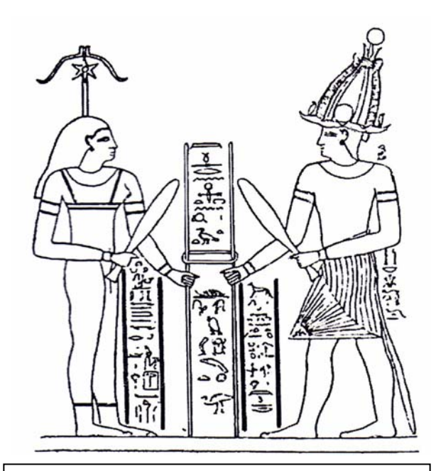
Figure Two. Goddess Seshat faces the King as they perform the Stretching of the Cord Ceremony at the Temple of Dendera (after R.W. Stoley 1931)

In addition to this more routinely allocated activity there were the irregular citations of the Stretching of the Cord Ceremony, known as the pedj shes ceremony, carried out when a new temple or palace was to be constructed. This sacred ritual is described in numerous hieroglyphic inscriptions and depicted in reliefs during various epochs of the ancient civilisation. Quoted for the first time on the Palermo Stone in year x + 7years (c.3005 B.C.) of the fifth king of the First Dynasty, Meretneit (also called Den), for the dedication ritual of what was the House (called) "Thrones-of-the-Gods" (by) the priest of (the goddess) Seshat. Coming up on this stone of history another two times – for the 2<sup>nd</sup> Dynasty ruler Neterimu's seventh year dedication