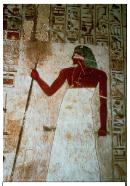
Figure Six. The tall figure of Rekhmire stands with the staff of authority in his hand within his tomb art life story in TT100.

The testimonial goes to great length to record the multitude of tasks which were the responsibility of the Vizier. As the translation of this lengthy life history is quite extensive I shall focus my citations on those pieces which are readily identifiable to his functions relating to the creation and maintenance of the cadastral boundaries and land title registration.