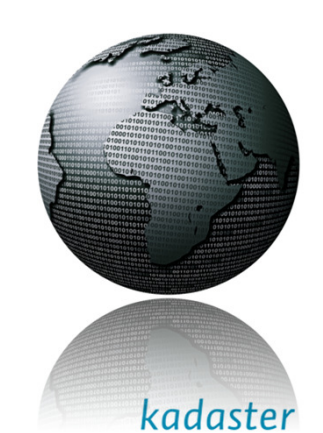
FIG Working Week Marrakech - May 2011