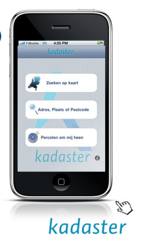
FIG Working Week Marrakech - May 2011