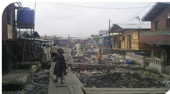
Plate1: Illegal structures in part of Ijora, Lagos