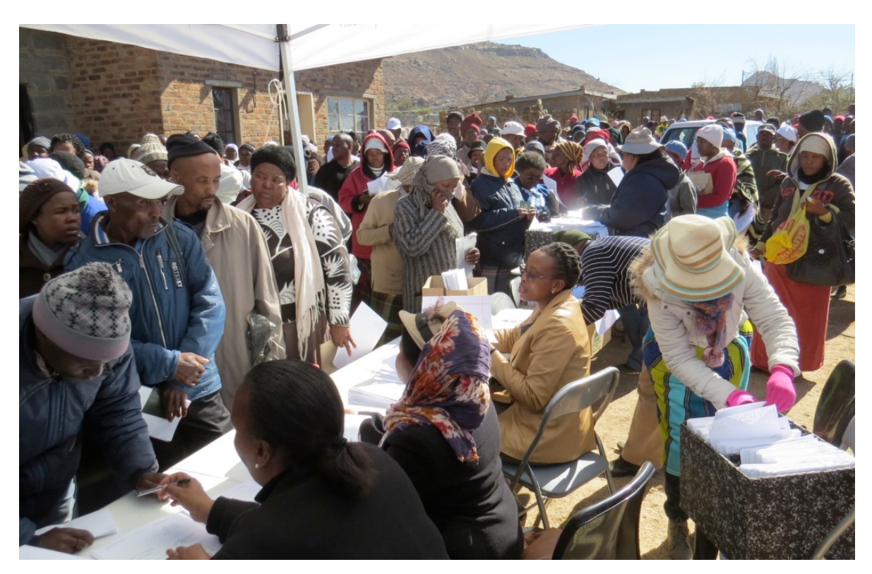
Figure 5: Lease Distribution