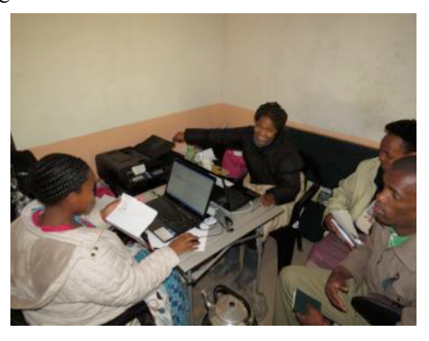
Figure 2: Data Entry in the Field