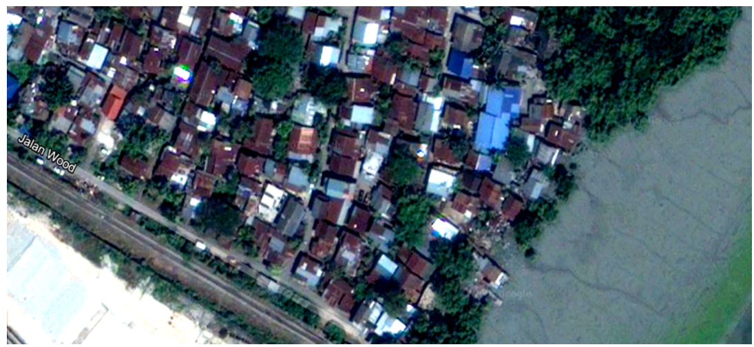
Fig. 1 Example of squatter area along the sea edge