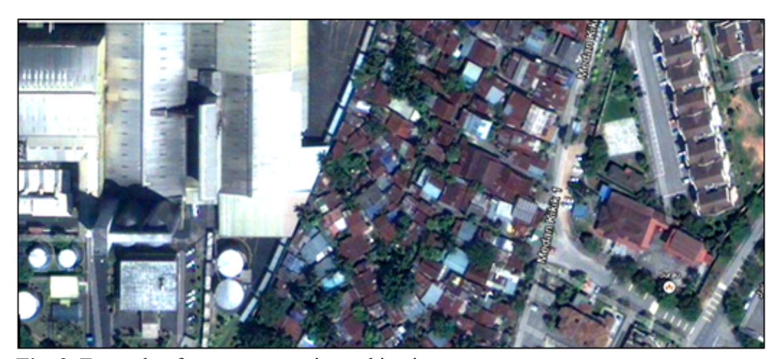
Fig. 3 Example of squatter area situated in city centre.

A Concept of Urban Poverty Area Identification Using Spatial Correlation Studies on High Resolution Satellite Imagery, (6843)