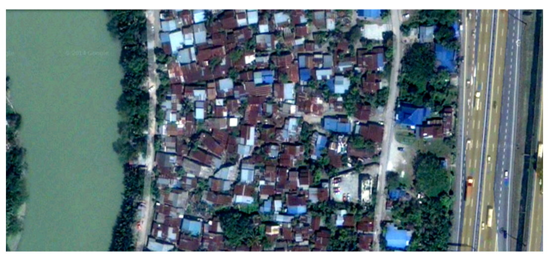
Fig. 2 Example of squatter area along the river's edge.