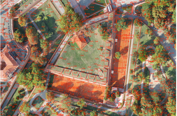
Fig.6. Point cloud (left) and ortho-photo map by using UAV technology overlapped with cadastral data for the location Kalemegdan fortress in Belgrade

The main problem arising in the case of treating a large number of points (Point Cloud) is the classification. By classifying the terrain points one can group the points within classes so that it becomes possible to reach a very precise digital terrain model (DTM). In the case of UAV everything is visible, but the problem is due to roofs and roof constructions. On the basis of visible roof constructions one can obtain information concerning the position of the principal axial points of an object. Where the scanning is performed by using the UAV system only, the characteristic object points must be scanned by applying one of the classical methods or by applying mobile laser scanning, whereas in the case of objects for which the details are scanned by using both systems, it is possible to determine the characteristic points by combining the obtained data.