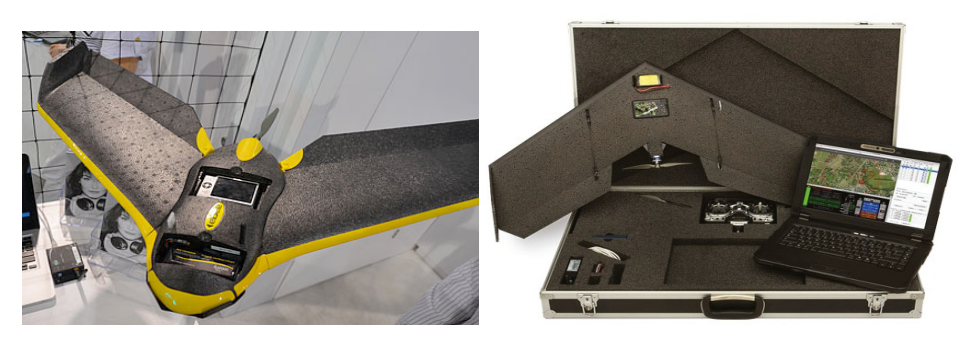
Fig. 5. Unmanned aerial vehicle Swinglet CAM (GeoGIS Konsultanti, Beograd 2013)

make possible landing even on limted areas. SenseFly has built an intuitive software "eMotion 2" with which one can plan, simulate, track and control the device trajectory, both before the flight and during it. The artificial intelligence built in the SenseFly autopilot analyses the data from the inertial measuring unit and GPS incessantly and takes care about all aspects of the flight mission. The Ebee autopilot saves all data and gathered images of the flight trajectory. These data can be taken by use of a USB. They are directly compatible with the Postflight Terra 3D-EB software. This software offers the possibility of automatic treatment of georeferenced orthomosaics and digital elevation models (DEM) to an accuracy of 5 cm (relative accuracy). The ground control points can be used for the purpose of accuracy improving.