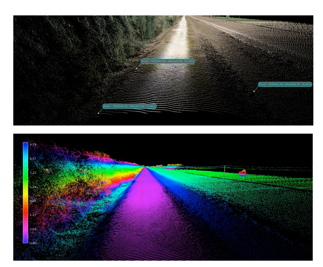
Fig. 4. Surveying the river embankment by using mobile laser scanning technology