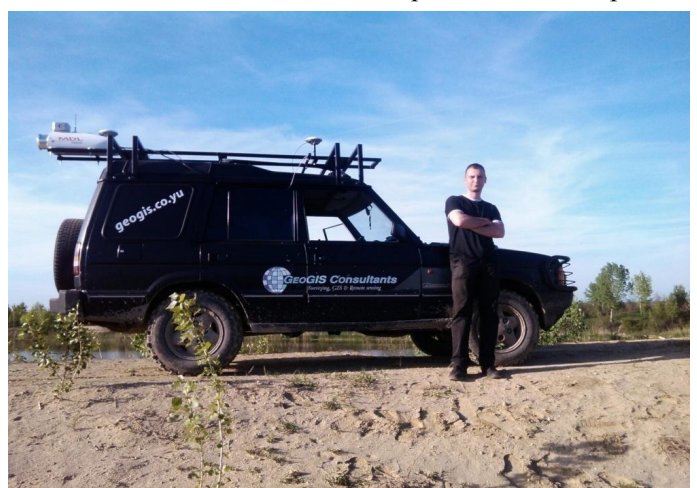
Figure 2. Mobile mapper system MDL DynaScan model 250

The implementation of the most recent laser scanning technique combined with the high-precision navigation system, yields a system for 3D scanning of roads, buildings and trees from moving vehicles. The device utilises several laser scanners where each of them performs up to 10.000 measurements per second with a scanning speed of at most 100 acts of scanning per second. In the case of this system different scanners, located at different places of the car platform, can be utilised.