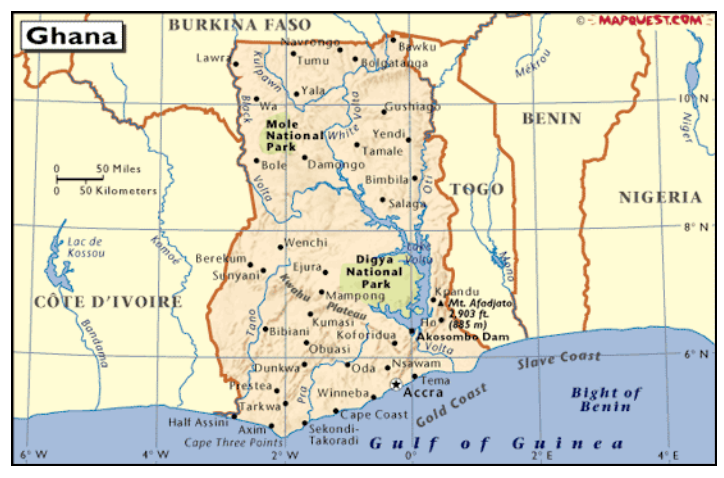
Fig. 1 Map of Ghana showing the Lake

land, 3 hours, majority of travelers would prefer to use the land due to fear in the use of the water body.