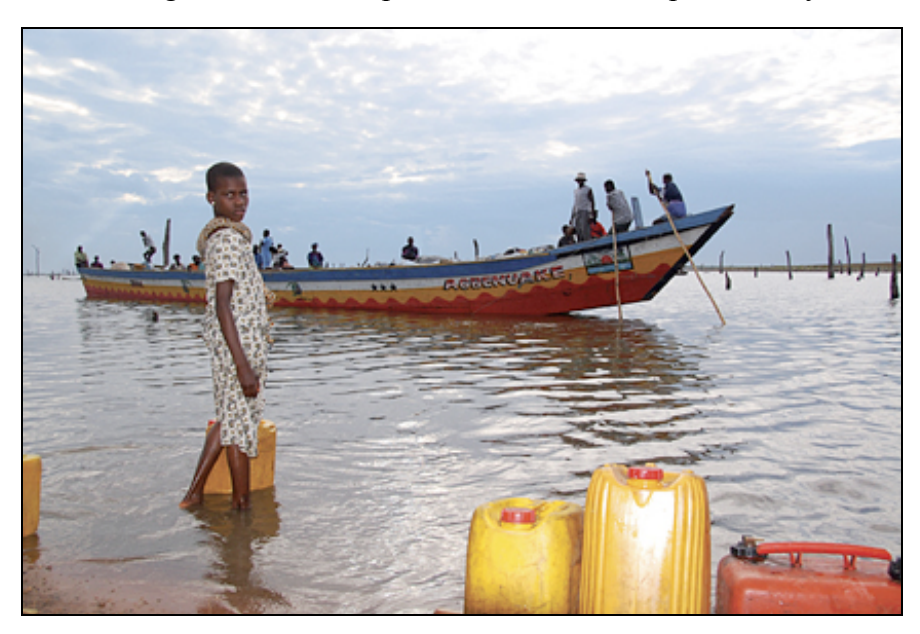
Fig. 8- A motorist canoe carrying passengers, food etc navigating around tree stumps

The objective above defines a clear indication that developing the water bodies to be used for transportation would bring about a vast improvement in the transportation system of the country.