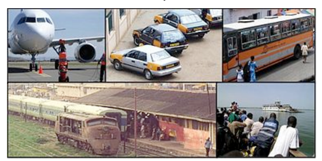
Fig. 2 Transportation in Ghana

Increased transport investment helped to increase the number of new vehicle registrations and transportation alternatives include rail, road, ferry, marine and air [6]. There has been an increased investment and expansion in the road transportation of Ghana [1], hence with respect to this mode of transport, many people prefer to use the road means of transport for their movements than the use of the other transportation alternatives.