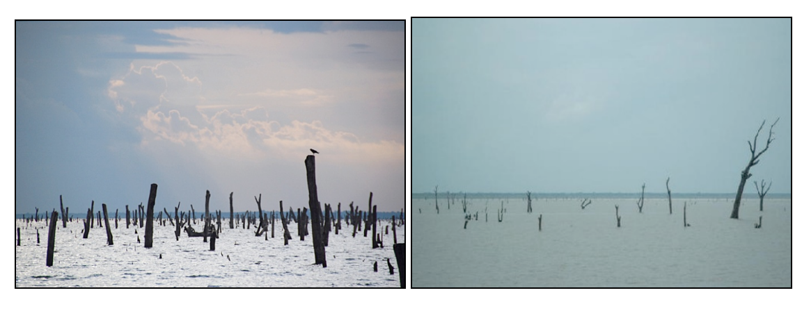
Fig. 5-Hard wood trees and tree stumps left standing in the Volta River