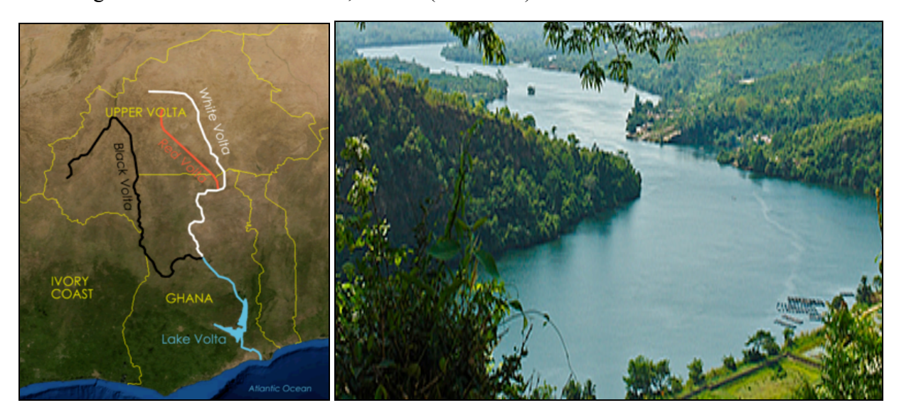
Fig. 3- The Volta River and the Three Main Tributaries

The Volta River is the main fresh water source for Ghana. It is a stream primarily in Ghana that drains into the Gulf of Guinea and Atlantic Ocean and has three main tributaries—the Black Volta, White Volta and Red Volta [Fig. 3]. The Volta River is formed by the confluence of the Black Volta and the White Volta rivers at Yeji in the central part of the country [7]. The river flows in a southerly course through Lake Volta to Ada on the Gulf of Guinea. The total length, including the Black Volta is about 1,500 km (930 miles).