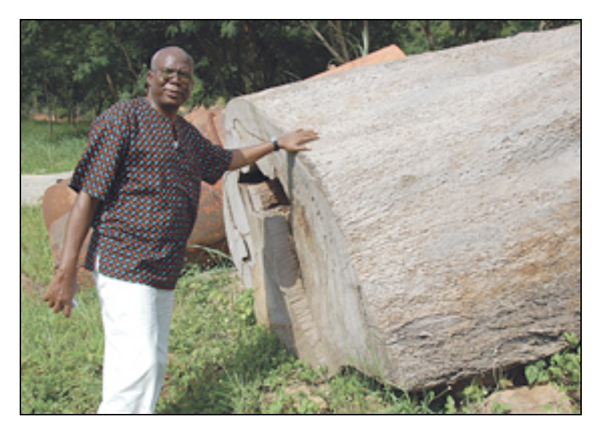
Fig. 7- a mahogany tree that was pulled from Volta Lake

destruction of existing forest and, according to Wayne Dunn, "could generate the largest source of environmentally sustainable natural tropical hardwood in the world [4]. This underwater forest activity will make the lake more navigable and safe and could generate the largest source of environmentally sustainable natural tropical hardwood in the world.