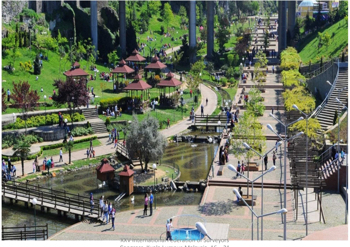
Congress, Kuala Lumpur, Malaysia, 16 – 21 June 2014