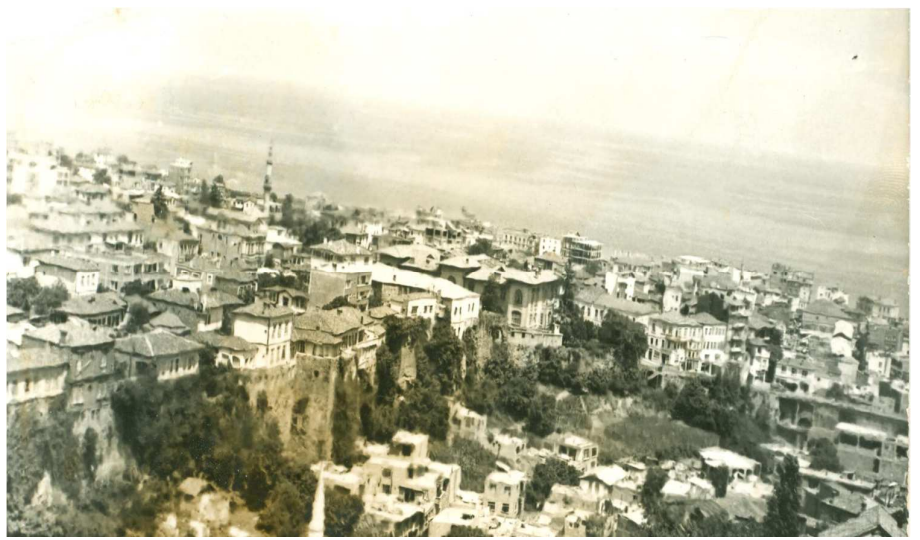
A view from Zagnos Valley in the 1970s.