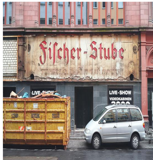
Figures 1 and 2: The problem of agglomeration of entertainment properties, gambling halls and „betting-cafes“ within the vivid, lively and contested area around the central railway station of Frankfurt

The result of gentrification has also been in Frankfurt the renovation of older homes, and the conversion of multi-unit rental properties into condominiums, high-end fashion retail stores and restaurants, especially in the core business areas and surrounding the financial district (see figure 3).