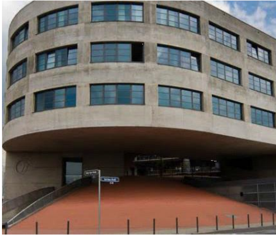
Figure 5: An ideal asset of an entertainment property – a discotheque

We have to be aware of the unclear legal definition of an “entertainment property” in Germany. According to the German Federal Administrative Court, the following differentiation of “What is an entertainment property?” exists: