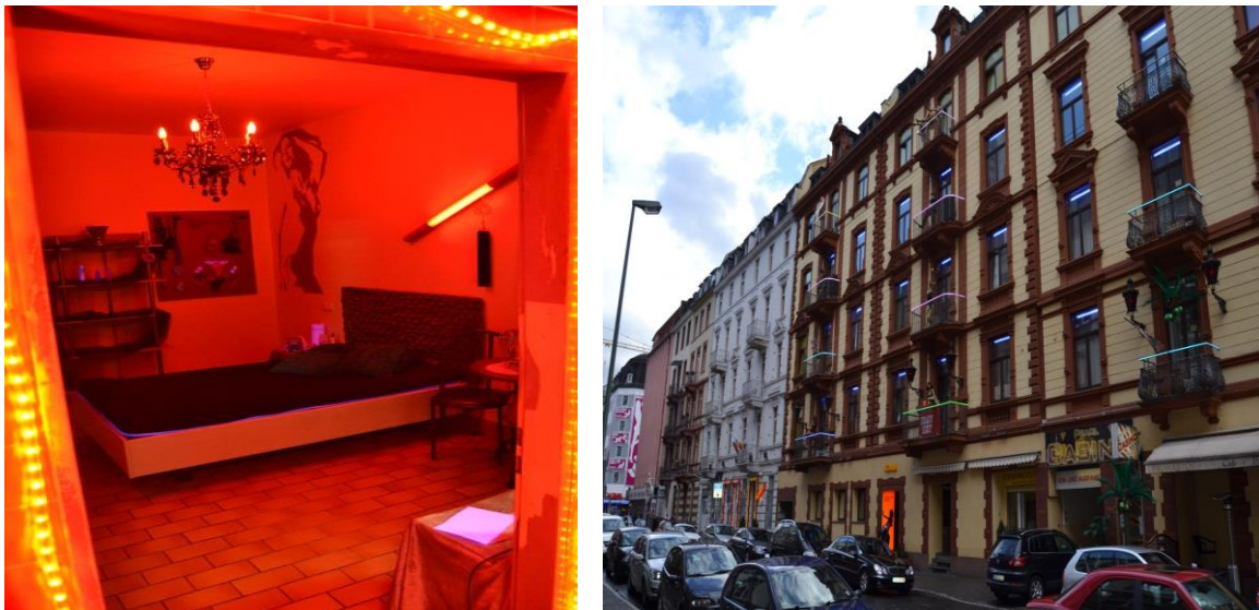
Figures 6 and 7: Brothel named “KOMM” in Frankfurt on the Main as subject to valuation: Cannibalization from competing leisure properties

Appraisal and assessment require market monitoring and data storage in a timely and updated manner for the purchase of prices, for rent prices and statistics regarding to construction materials. The land-information-system (LIS), consisting of cadastral maps and land registry, serves both as data storage and land valuation mapping to combine property and site related data (e.g., size, location, condition). Actualization of data should happen to secure the updating of data bases and to ensure the integrity of the tax base on immovable properties to distinguish between data assessed values (Kleiber 2014). It is essential to actualize the existing Data Bases (DB), especially for entertainment properties with a comparable short life expectancy. The newly (2010) implemented ImmoWertV [“Immobilienwertermittlungsverordnung”: German Ordinance on the Valuation of Real Estate] contains internationally recognized and nationally owner-binding rules for determining the market value using three standardized valuation methods: comparison method, income (investment) method, and the depreciated reconstruction (cost) method. The ImmoWertV describes the necessary data, and refers to the data that were recorded by the committees of valuation experts. Publicly-appointed valuation experts refer to these methods and the data provided by the committees of valuers in order to guarantee a level of comparability and transparency on the land market (European Valuation Standards).