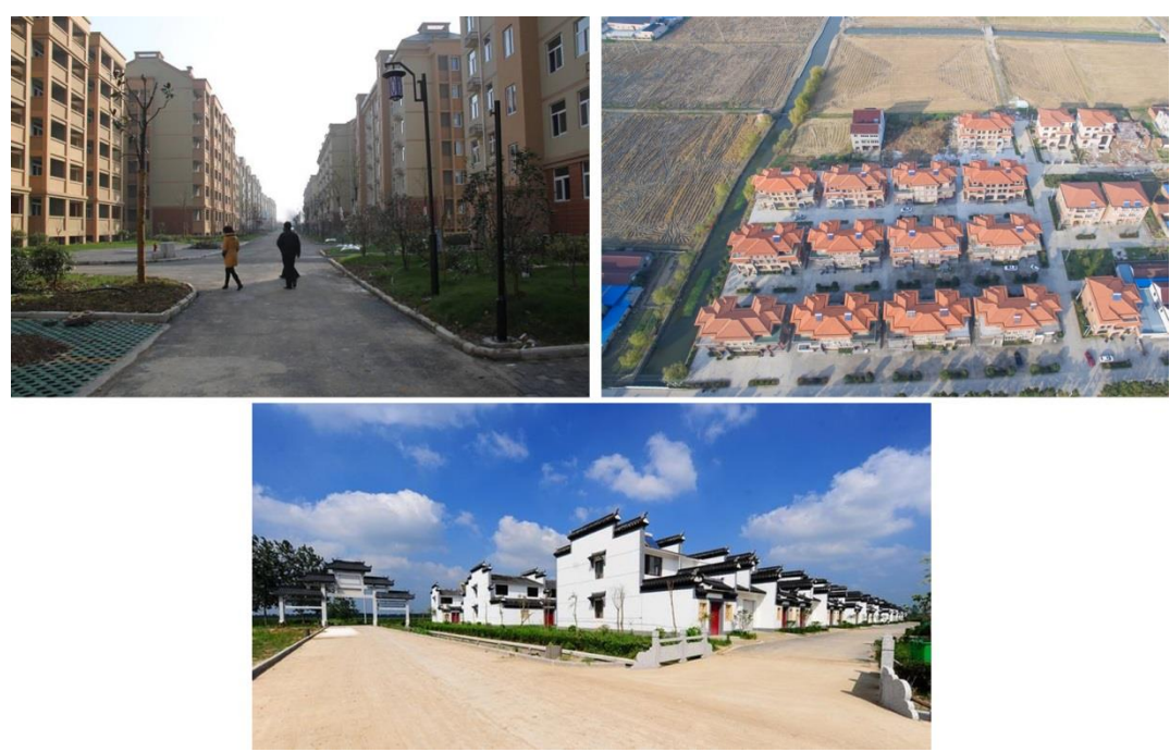
Fig.3 Village appearance Before Consolidation