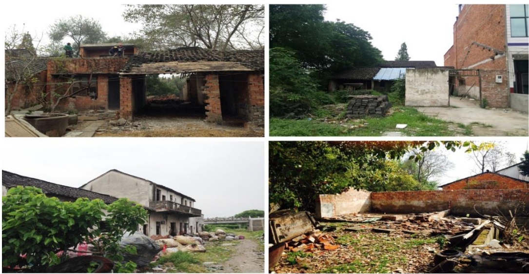
Fig.2 Village Appearance Before Consolidation

convenience of connecting with central city, the center villages have the certain advantages over other types of villages in the aspects of transportation, economy or industry, Therefore, the center villages also are considered to be the reserve regions for future expansion.