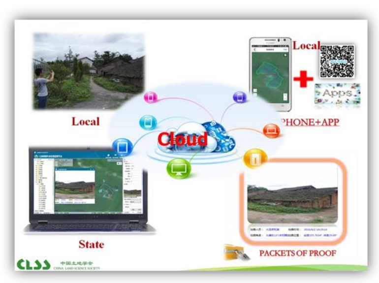
Figure 4 Flow chart of Internet+ field proof provision

changed the phenomena of repeated local proof provision, repeated national onsite field verification, and waste of social resources in the past. It has also become a new model of field survey, proof provision, and online supervision. The flow chart of field proof provision is shown in the figure below.