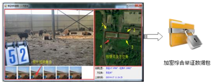
Figure 1: Five-element proof provision

Internet+ survey technology makes full use of mobile Internet, cloud services, and 3S (RS/GIS/GPS) integration technology. It innovates on existing information collection and monitoring technologies. Surveyors use smart phones to collect comprehensive information such as land boundary, onsite photos, GPS location, shooting direction, and shooting time. Survey and proof information are encrypted and transmitted over Internet and then stored on cloud servers. The reviewers conduct reviews and real-time monitoring online, which ensures the authenticity of the survey results while greatly reducing capital, manpower, and time costs during information transmission. For a mobile phone, the positioning accuracy of A-GPS is around 10m, the direction accuracy of the electronic compass is not more than 15°, and the resolution of onsite photos is about 1024*768, which can meet the requirements of survey, proof provision, and verification. The following figure is a schematic diagram of using a mobile device to provide proof of five elements which are person, time, device, coordinates, and direction.