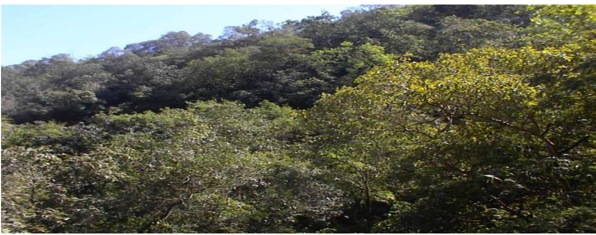
Recovery of forest around Filfil-

Eye witness observations of the area confirm that stability has allowed natural habitat to gradually recover. It appears that forest BD is on the right track, and the 'naturalness' of the area is on recovery. This is encouraging in terms of forest recovery, wildlife growth and mitigation of soil erosion and land degradation. But this has to be certified in terms of statistics. Success of any development programme is measured in terms of set-out criteria. The indicators of success for BD conservation could include a wide-range of tools such as the status of wildlife species, tree species, diversity and coverage, soil and water quality and quantity, lifestyle of local people, access to health, education, safe water, etc.