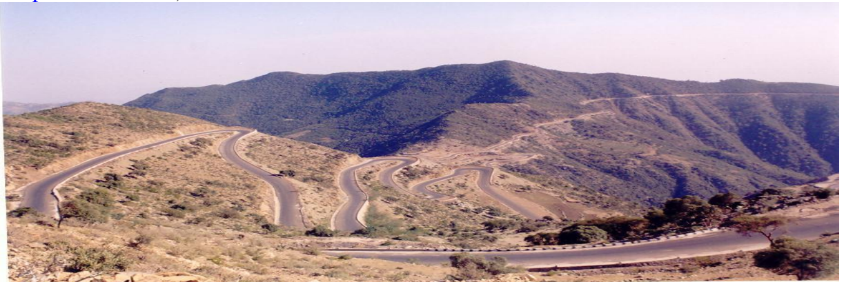
Asmara-Massawa Road passing through the National Park (Adapted from the Department of Environment, 2015)

The location of the Green Belt area is suitable for ecotourism. The spectacular land scenery is stunning beautiful with diverse fauna and flora. The area is 'outstanding spot for bird-watching', referred as 'paradise on earth' (www.shabait.com/about-eritrea/erina/15254-the-potentials-fortourism-development-in-eritrea). It has impressive weather with low lying summer fogs, landscape and sceneries, hot springs, diverse cultures and traditions of ethnic groups. The beautiful scenery, wildlife, peace and security, hospitality and generosity of the people, etc. make the area suitable for ecotourism development (www.shabait.com/about-eritrea/erina/15254-the-potentials-for-tourism-development-in-eritrea).