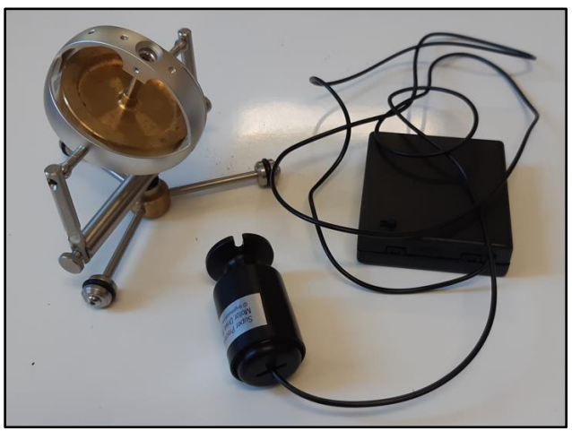
Figure 1. Demonstration gyroscope.

free gyroscope, behaviour of a constrained gyroscope, and behavior of a constrained gyroscope under the influence of an external torque such as Earth rotation.