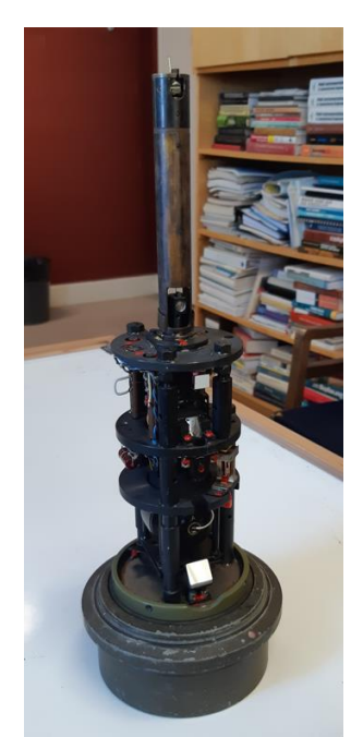
Figure 2. GAK1 gyroscope with casing removed.

A second-hand GAK1 gyroscope has also been used, with its outer casing removed, to demonstrate how a constrained gyroscope is then integrated into a surveying instrument that can be affixed to a theodolite for determination of the North direction. This is an especially salient example, as it is the same model of gyroscope that students use for a course laboratory exercise shortly after gyroscope concepts are introduced. The instrument, with cover removed to show the interior workings, is shown in Figure 2.