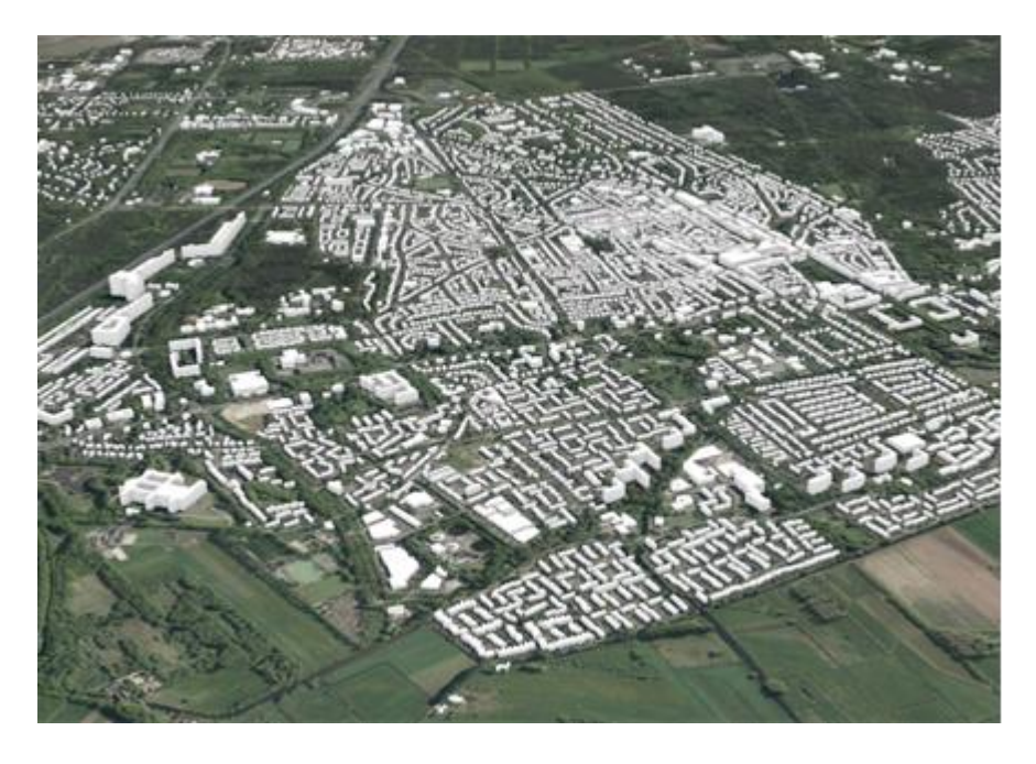
Figure 2: 3D model of the municipality of Zeist in the Netherlands

Finally, several sources were found with detailed information regarding construction costs in several European countries (e.g. <u>http://constructioncosts.eu/</u>, Eurostat, 2020), including the countries covered in this research. By using Econometric and Machine Learning techniques these sources can be combined with the proposed model to calculate relative differences between countries in the form of an index.