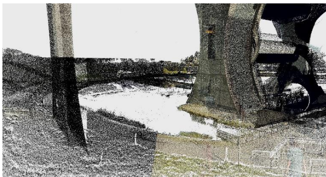
Figure 4 An example of the point cloud data O'Keeffe 2019

The data gathered was edited during the evenings of the fieldwork and on return further editing was completed by one group member who was proficient in the use of the ScanMaster software. Several omissions were identified and it was required to