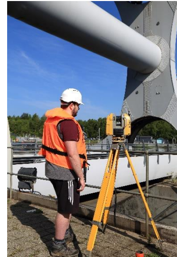
Figure 2 Student undertaking scans in line with the accepted RAMS, Brammer L 2019

Designing the study required that the Author set out a full briefing and treated the selected students as employees. To reflect this the students to undertake pre-survey works, including detailed Risk Assessments and Method ( Rojas, EM and Mukherjee, A; 2005 ) Statement (RAMS) (see figure 2), which were approved by SC. They were required to consider all the resources and produce a list of kit and ensure everything worked and batteries were charged. The team size reflected the time limitations and the expected resources adopted in professional practice.