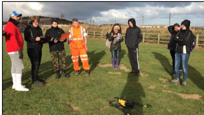
Figure 1 The students having a demonstration of the UAV (Unmanned Ariel Vehicle) for surveying Spalton D 2016

Field trips partly address the environment issues yet such experiences often have large groups and the work elements are simply demonstrations of industrial practice in context. This reduces interaction, leaving some group members on the periphery and not fully engaging, typical session is shown in Figure 1, as can be seen there is not full engagement.