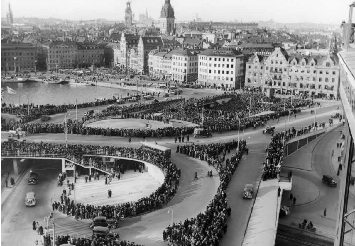
Opening in October 1935.