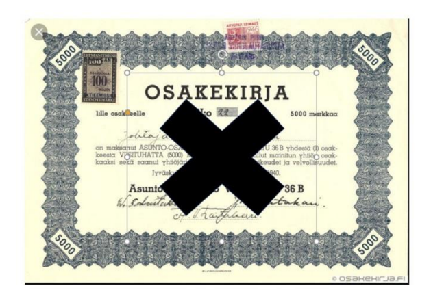
Figure 4: Each hard copy share certificate must be submitted to NLS for annulment in connection with the first registration of ownership.

The first registration of ownership will be based on the hard copy of share certificate. The original certificate must be submitted to NLS. If the share certificate has been held by a bank as collateral for a loan, a digital pledge note will be registered for the owner apartment in the same connection.