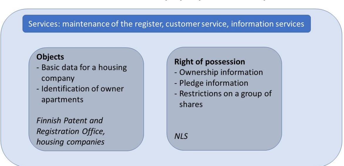
Figure 2: At the first stage, basic information on housing companies and owner apartments will be maintained in the residential and commercial property information system. Housing companies and the Finnish Patent and Registration Office will be responsible for the maintenance of this information. Information on ownership, pledging and restrictions will be registered upon application or notification, and NLS will be responsible for the registration.