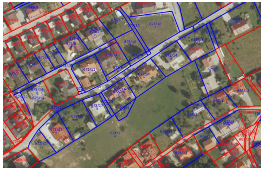
Figure 4: The ZKN after the implemented positional accuracy improvement and ZKP integration, as seen in the public viewer PREG.KEY: The ZKN obtained by measurements – red, the ZKP after positional accuracy improvement – blue.