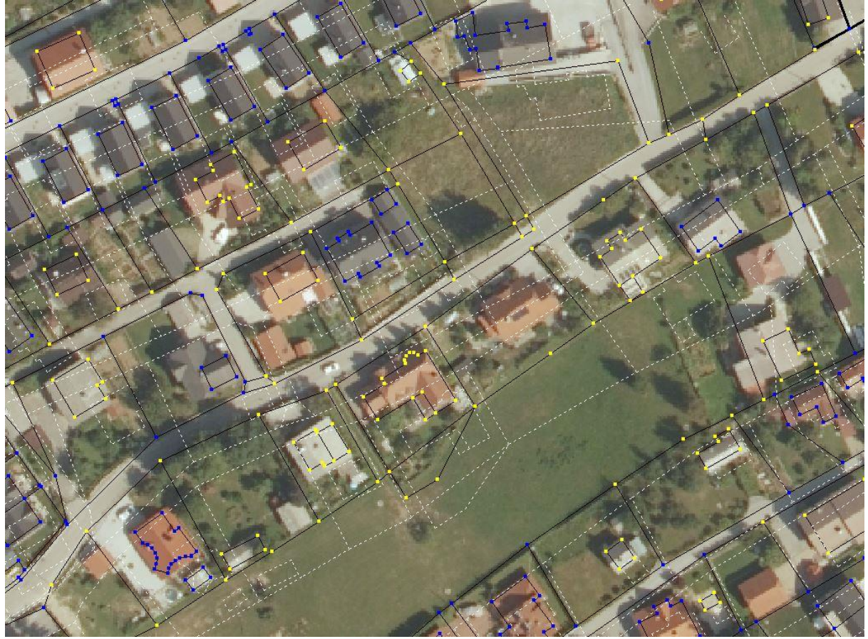
Figure 3: The result of the improved positional accuracy of the ZKP ( SysGeoProTM ). KEY: reference points – blue, digitized points – yellow, ZKP lines before improvement – intermittent white, ZKP lines after improvement – black.