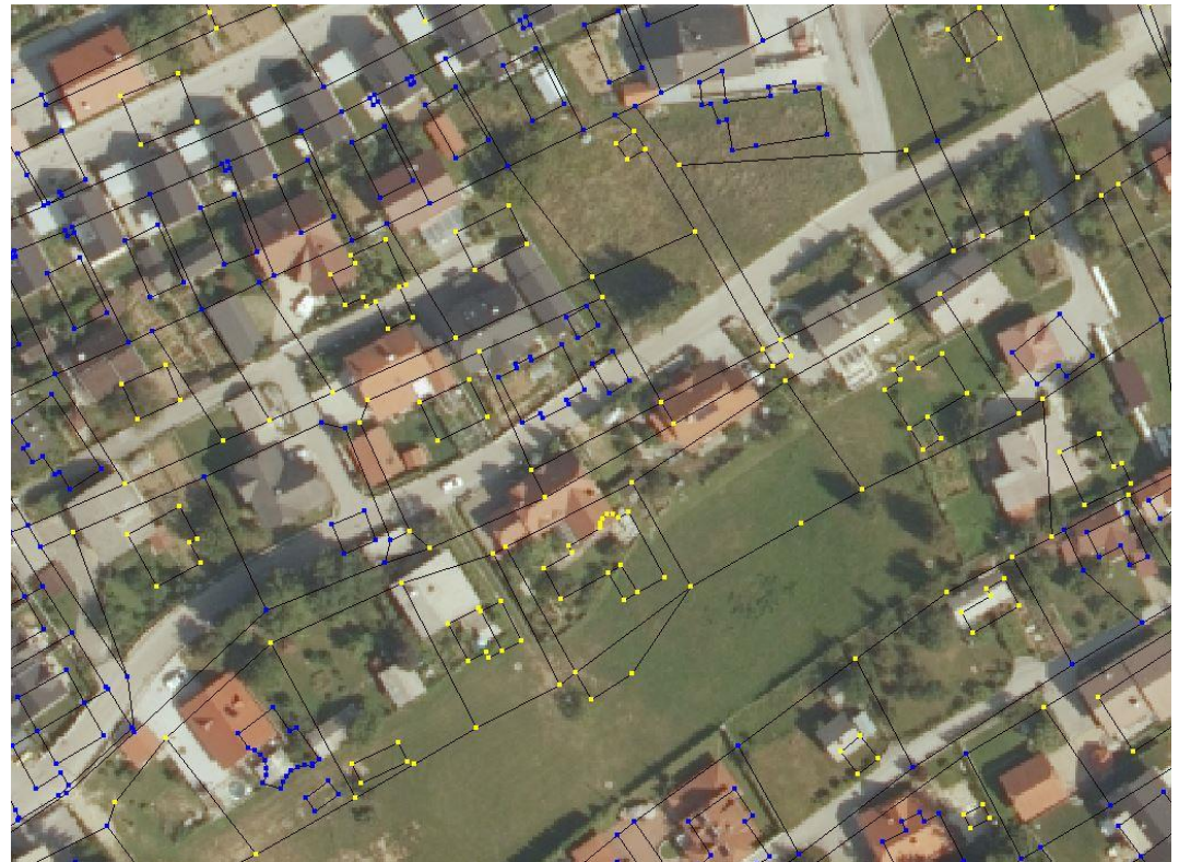
Figure 1: Land cadastre graphical data: – the ZKP ( SysGeoProTM ). KEY: reference (measured) points – blue, subject (digitized) points – yellow, the ZKP lines – black.

The use of an appropriate number of high quality reference points and their optimal distribution is important in order to achieve a quality adjustment and homogenisation result of the ZKP. The impact of reference points on the positional correction of subject points is decreasing with distance, therefore it is important to have evenly distributed high quality reference points throughout the entire area under consideration.