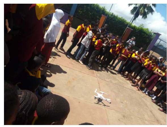
Figure 7b: Training on the use of drone.