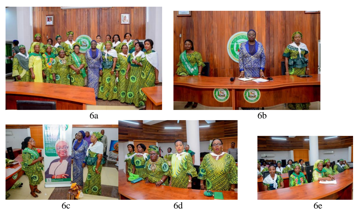
Figiures 6a – 6e: WIS Ogun, visit to Her Excellency Engr. (Mrs.) Noimot Salako-Oyedele, the Deputy Governor of Ogun State on 12/11/2019

A Courtesy visit was made to the Deputy Governor of Ogun State who is a woman in the person of Engr. (Mrs.) Noimot Salako—Oyedele in November 2019; she was delighted to receive the members of Ogun State WIS as well as other Western WIS members who were in attendance. She consented to be the Special guest of honour at the upcoming National Women — In — Surveying Conference coming up in March 2020 at Abeokuta in Ogun State. See figures 6a — 6e below.