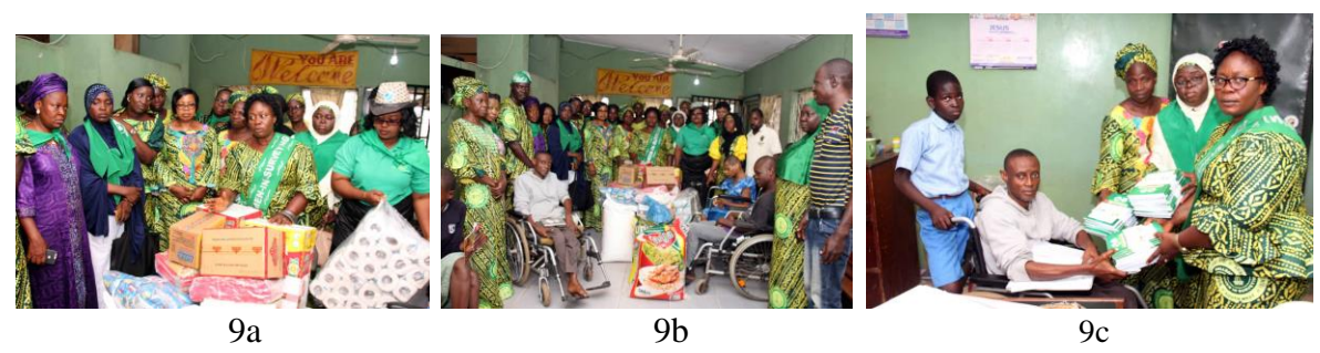
Figures 9a, - 9c: South Western Region WIS distributing gifts to the Physical Challenged in South West.

Figure 8a and 8b: Exercise books shared during a public lecture