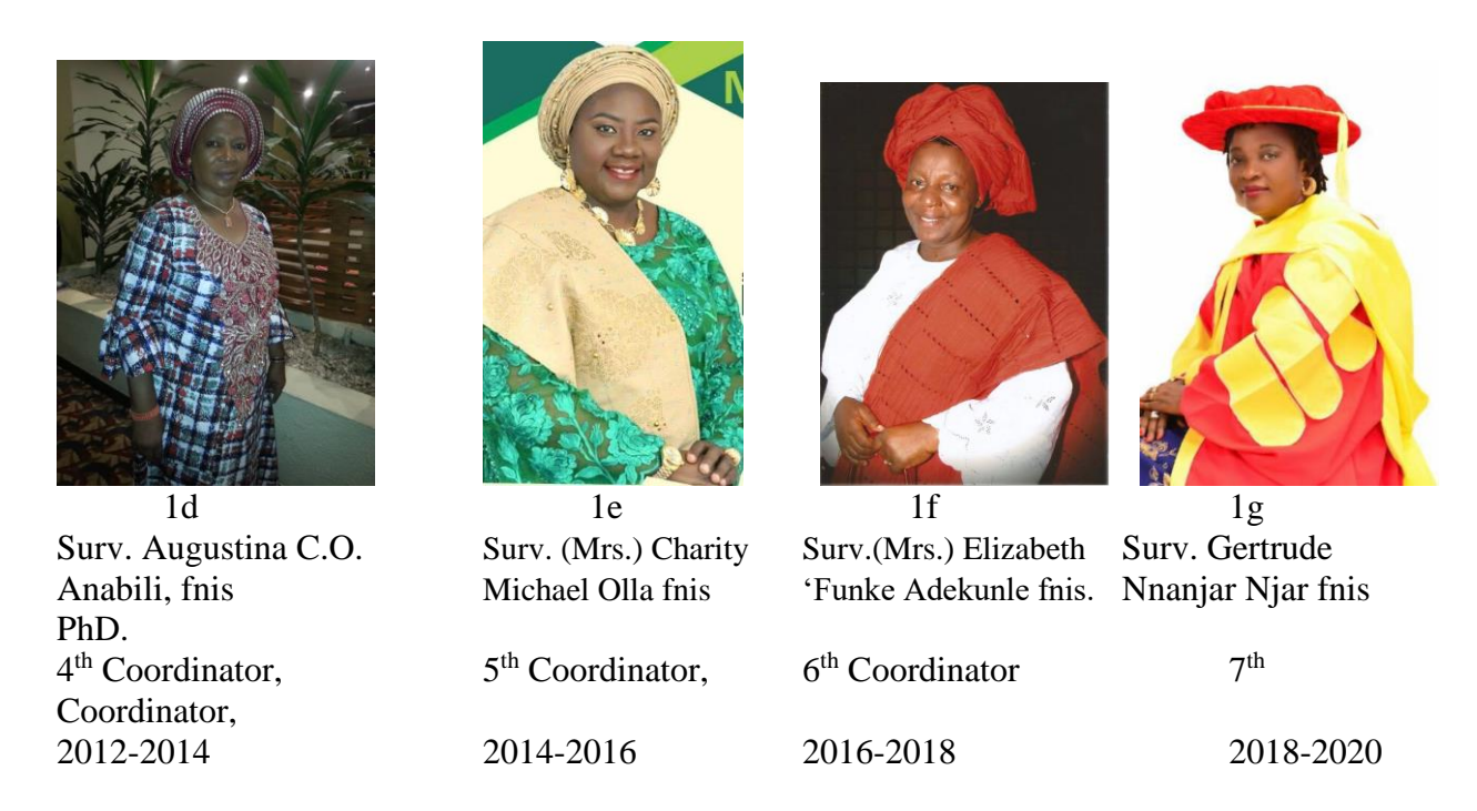
Figure 1a-1g; Past and present National Coordinators of Women-In-Surveying Nigeria.