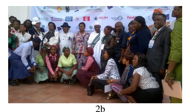
Figure 2a and 2b. WIS National Conference 2018, in Port Harcourt, River State. Present were, His Excellency, Surv. Hassan Suleiman, Honourable Minister of Environment, Her Excellency, the Deputy Governor of Rivers State, The President of the Nigerian Institution of Surveyors, Alabo C.D. Charles fnis and other dignitaries and school Children.