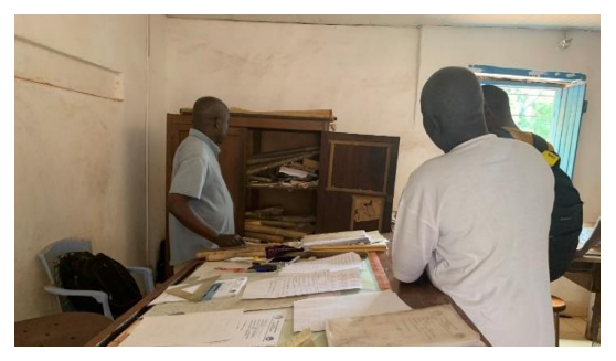
Drawing equipment and filing system in the draftsman's office, Ministry of Physical infrastructure &urban planning, Wau

The survey reviewed and assessed capacity needs on gender sensitive land administration and management and dispute resolution and reviewed the existing land administration system with the aim of identifying areas to enhance the land management system including the community system. Under capacity assessment, office equipment was found to be inadequate and there is need for capacity building and training on various land management processes. Mapping of land management systems revealed overlapping of responsibilities. Practical and immediate opportunities to support the Ministry of Physical Infrastructure and Urban Planning were identified and included support to government to have one national lease