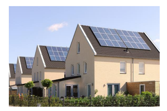
Figure 3: Energy transition: heat pump (left) and solar panels (right) might lead to new forms of modular financing.