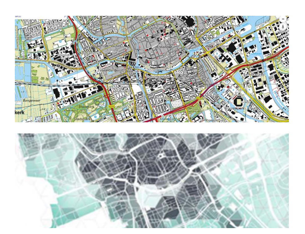
Figure 4: Visualisation of the density of paved areas (grey) and green areas (green) City of Groningen as basis for policy making on conversion measures.