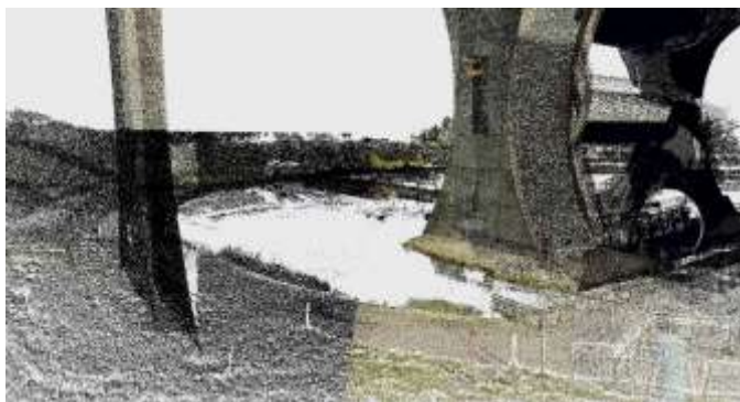
Figure 4 An example of the point cloud data O'Keefe 2019

The data gathered was edited during the evenings of the fieldwork and on return further editing was completed by one group member who was proficient in the use of the ScanMaster software. Several omissions were identified and it was required to