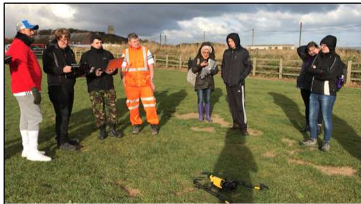
Figure 1 The students having a demonstration of the UAV (Unmanned Ariel Vehicle) for surveying Spalton D 2016

Field trips partly address the environment issues yet such experiences often have large groups and the work elements are simply demonstrations of industrial practice in context. This reduces interaction, leaving some group members on the periphery and not fully engaging, typical session is shown in Figure 1, as can be seen there is not full engagement.