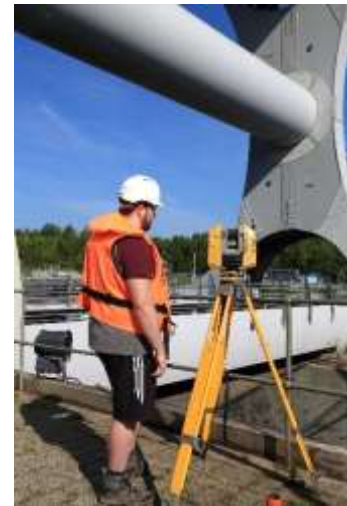
Figure 2 Student undertaking scans in line with the accepted RAMS, Brammer L 2019

The student were provided with scaled Ordnance Survey drawings of the wheel and the operating schedule of the wheel during opening hours. One member of the group did some pre-planning of scan locations and considered the times required for each scan. After their detailed planning all the information was reviewed academically prior to passing to the Client. The Client added a few requirements about working around the Wheel but accepted the RAMS, which allowed the group to progress to the survey.