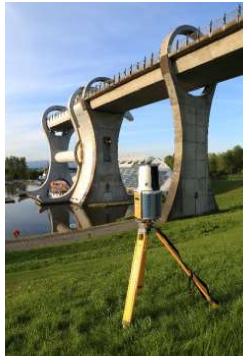
Figure 3 showing the scale of the site Brammer L 2019