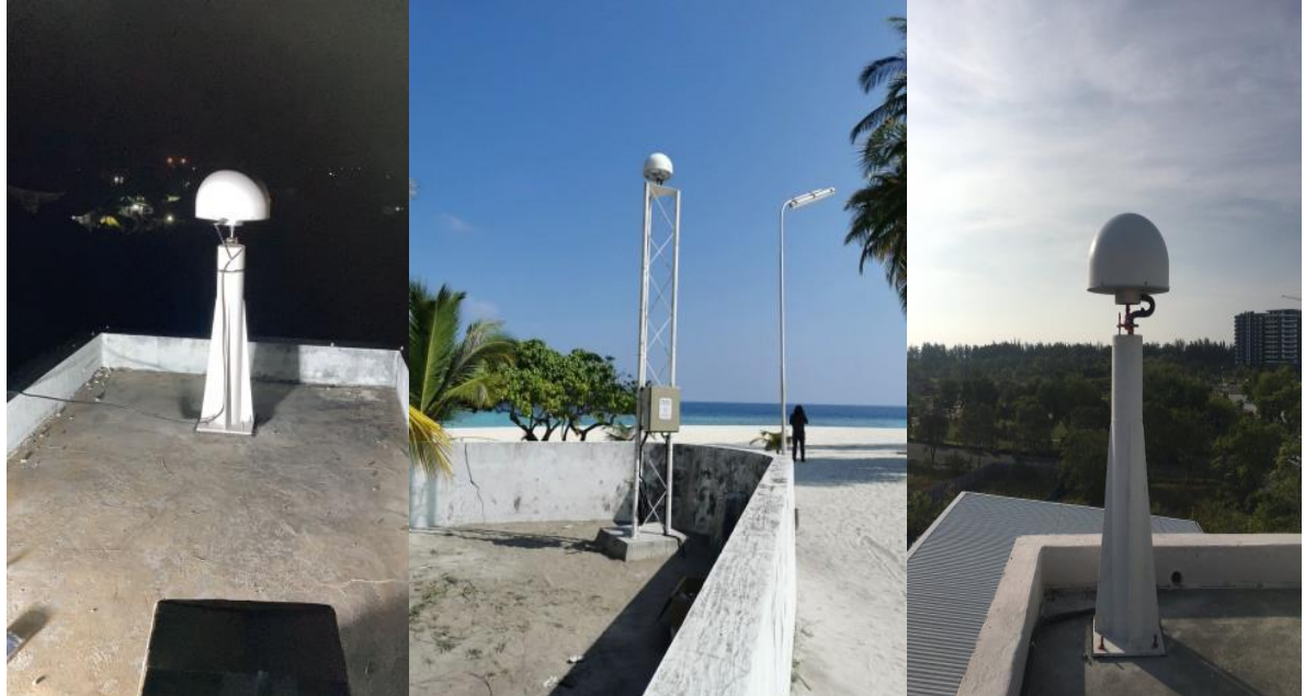
Figure 2 – Examples of MVCORS installations in Addu (ADDH), Kudarikilu (KDRK) and Malé (MALC), from left to right