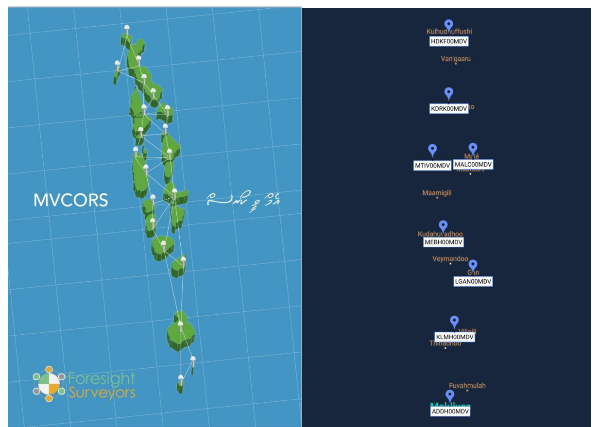
Figure 1 – Distribution of the MVCORS stations when the project has been fully completed (left) and current distribution of installed stations (right)

Figure 1 shows the entire MVCORS once the project will be fully completed (left) and also the eight stations already installed in the Phase I (right). It is foreseen a total number of 21 stations covering the entire territory of Maldives.