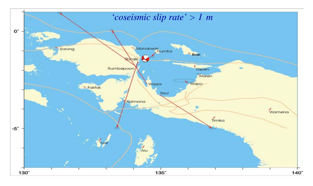
Figure 5 : The velocity field of the Bird's Head portion of Papua after Ransiki earthquake 10 October 2002, Mw = 7.6