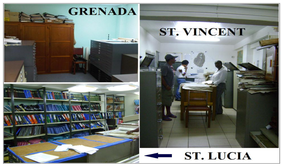
Illustration 4: Cadastral storage facilities (Vaults) in St. Lucia, St. Vincent and Grenada