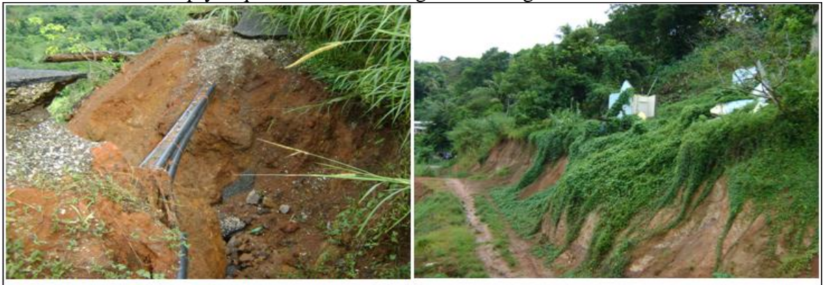
Photo: Unstable soils on slopes all across St. Lucia are today a major cause for concern among environmentalists, government officials, and the general public. Nation-wide studies have shown that a large percentage of the islands' unplanned hill-side developments are situated in environmentally sensitive zones. (St. Lucia, 2011)

The ESDU recognizes the importance of spatial technology in determining: Which settlements are at greatest risk and would require relocation; those areas best suited for resettlement; and those that would simply require enhanced mitigation arrangements.