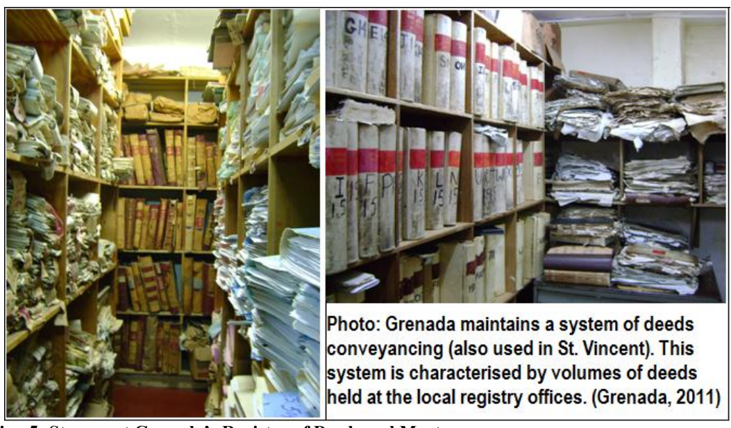
Illustration 5: Storage at Grenada's Registry of Deeds and Mortgages