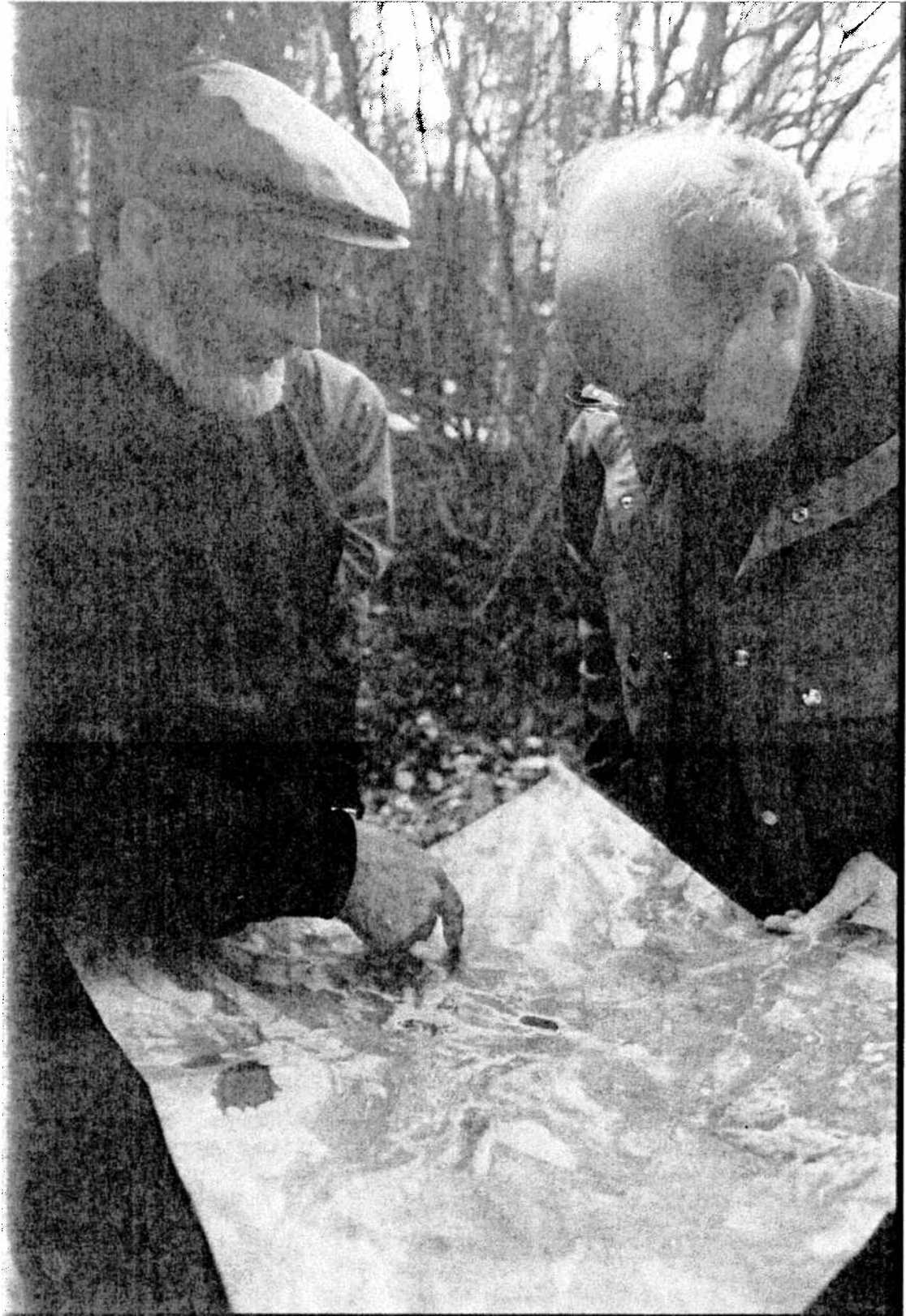
The determination of the position of boundaries. La fixation de la position des limites des terrains. Die Bestimmung der Lage von Grenzen.