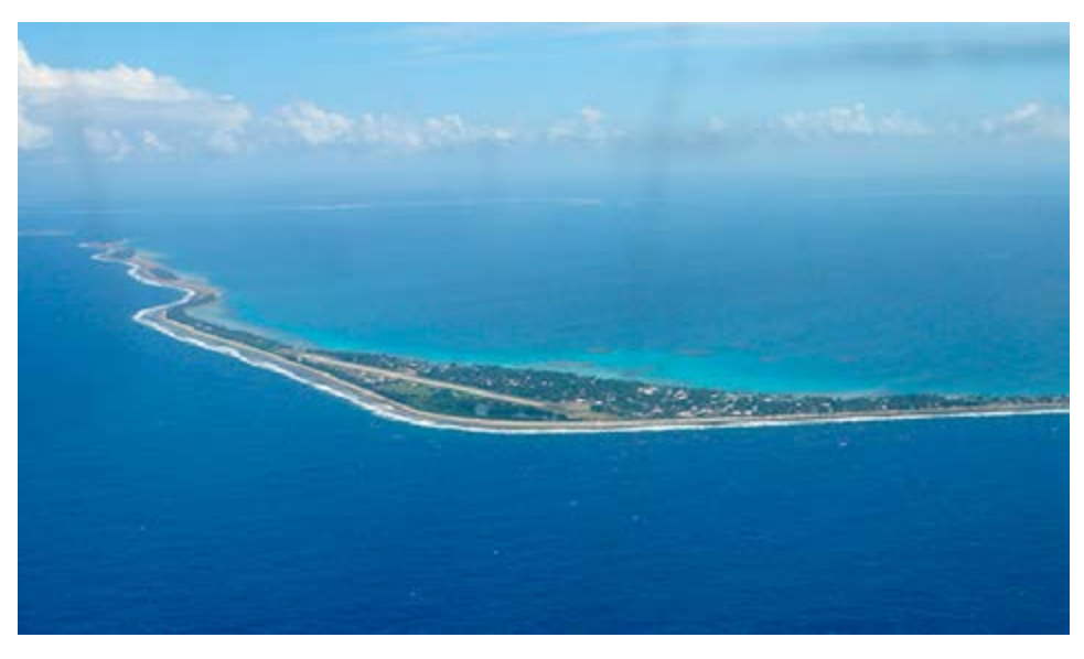
Low laying atoll, Tuvalu in the Pacific Ocean. The capital, Funafuti, is on average two metres above sea level.