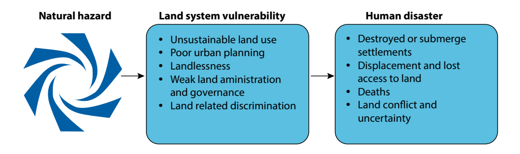
Figure 2: How land system vulnerability can create human disasters (UN-HABITAT, 2010:14).

After an extreme weather event, vulnerability in the land sector and the systems that support it can create human disasters as is illustrated in Figure 2. Key land administration measures that could be taken in the event of a natural disaster are set out in Table 2.