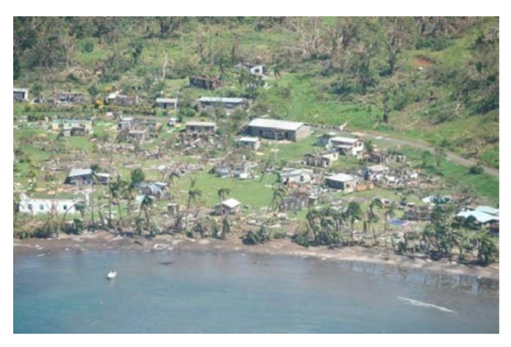
Fiji. Damage of cyclone Winston, February 2016.