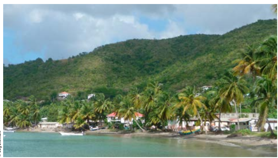
Coastal settlement, St. Lucia, Caribbean.

Capacity and governance is weak in many SIDS countries, with governments struggling to formulate appropriate policy and legislative frameworks and to develop and maintain effective systems to put policy into effect and enforce legislation. This weak governance results in increased land disputes and conflict over land and is a serious impediment to investment and economic development. Every year the World Bank publishes a global ranking of the ease of doing business. This ranking covers a range of different aspects including the ease of registering property. Although there are issues with the way the ranking are prepared, they are compiled after extensive consultation with experts in the countries being assessed. Based on the assessment in 2016 it is very difficult to register property in all but a few SIDS countries.