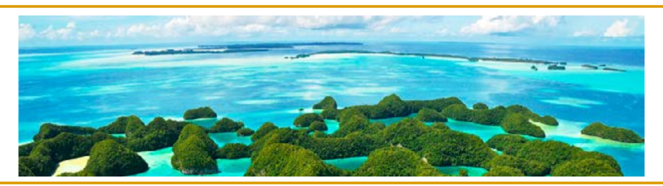
The Role of Land Professionals

Responding to Climate Change and Tenure Insecurity in Small Island Developing States