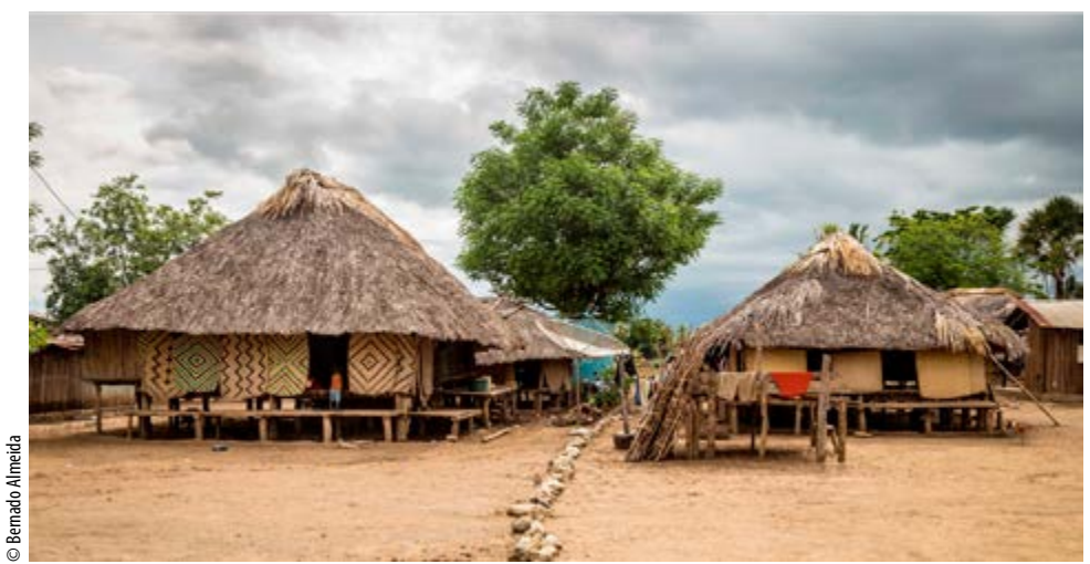
Rural village, Timor Leste.

The background material is presented in some detail in chapter 5 below. The outcome of the presentations and discussions are summarised in the declaration as presented in chapter 3 above.