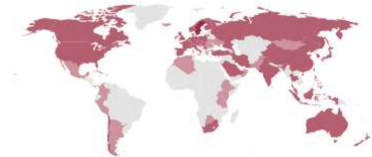
FIG is an organization that makes an effective contribution to the work of the technical committee or subcommittee for questions dealt with by this technical committee or subcommittee.